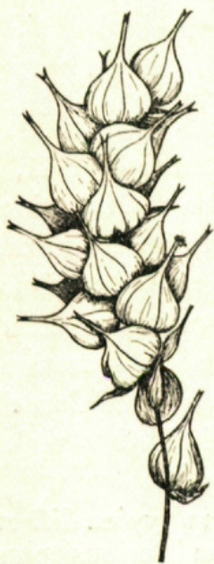
Fig. 1. Spike of C. Tuckermani niagarensis . \times \frac{3}{2} .

Pressed young material can evidently not be determined, as many June, and even some July, collections do not seem to have the perigynia matured enough to show determinative characters after being pressed; e. g., of three sheets of Sartwell's specimens in the National Herbarium, I care to cite only one as showing evidence of representing the variety I describe. The original illustration of Dewey's seems to have been made from very young material and can easily confuse one in trying to study the species in its matured forms.