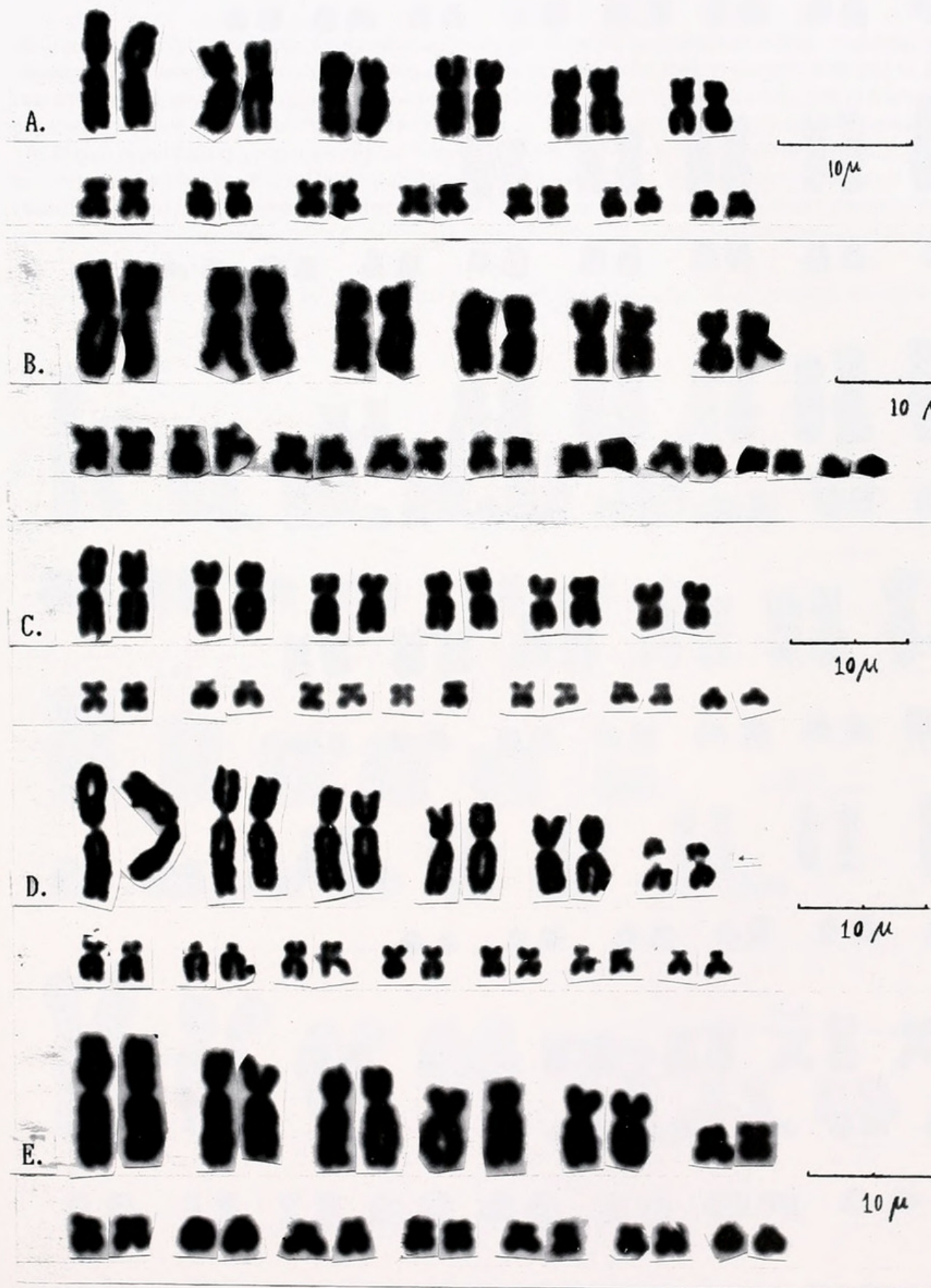
Figure 3. The karyotypes of Megophryinae species: A-B. Megophrys minor ; C. M. lateralis (Tengchong); D. M. omeimontis ; E. M. giganticus ; F. M. daweimontis sp. nov.; G. M. palpebralespinosa ; H. M. parva ; I. M. lateralis (Hekou); J. M. kuatunensis ; K. Ophryophryne microstoma .