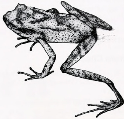
Figure 2. Megophrys daweimontis sp. nov. female X 1.

Paratypes: 17 adult males (KIZ 93069-KIZ 93085) and 3 adult females (KIZ 93086, KIZ 93087, KIZ