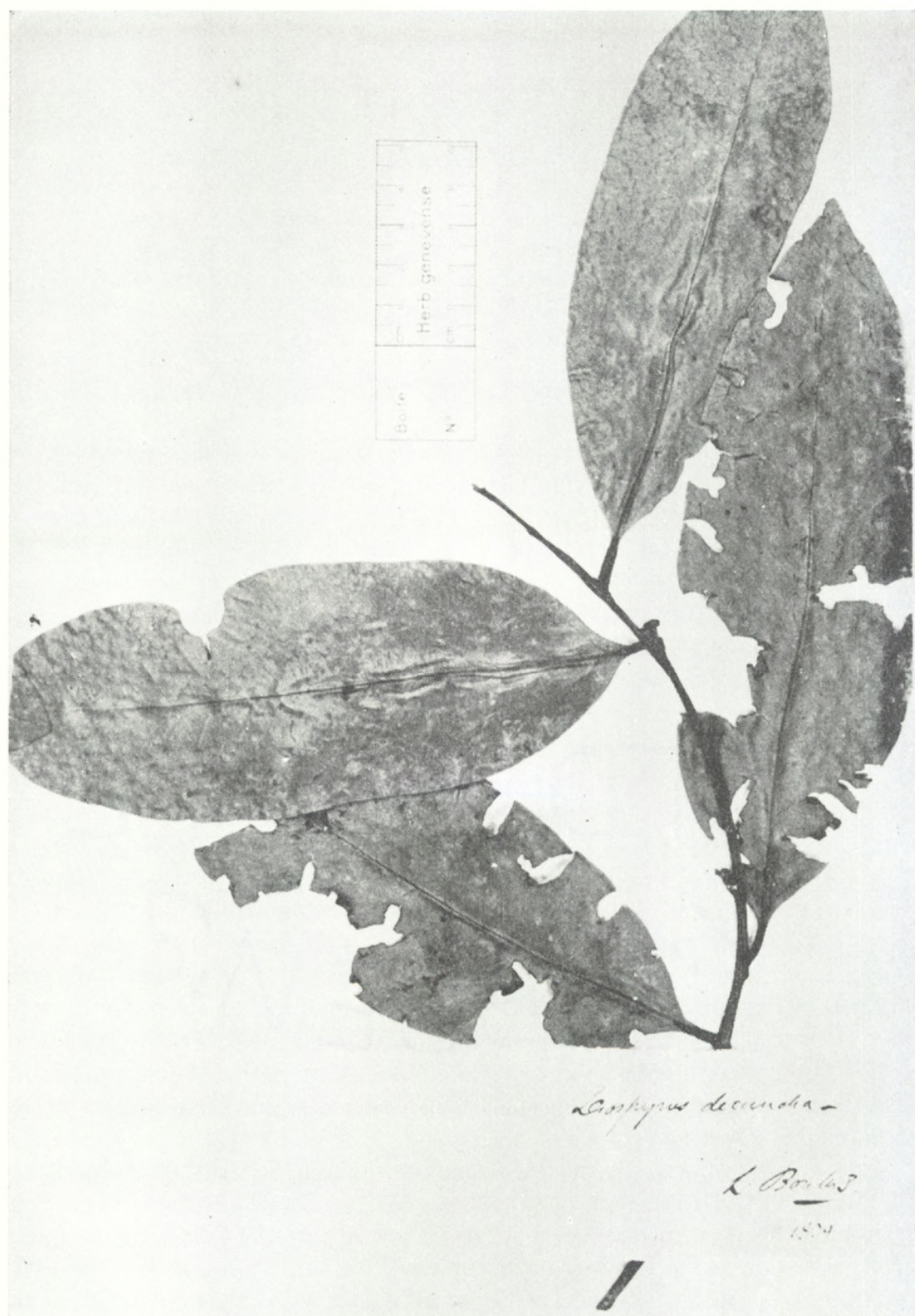
HOLOTYPE OF DIOSPYROS MEMBRANACEA A. DC. FROM MAURITIUS. (Pro-dromus Herbarium, Geneva.)

acteristics to be seen in the illustration are pertinent to the Central American species. The common name of "false mangosteen" may also be considered as support. The correct name and the synonymy of this species appears to be: