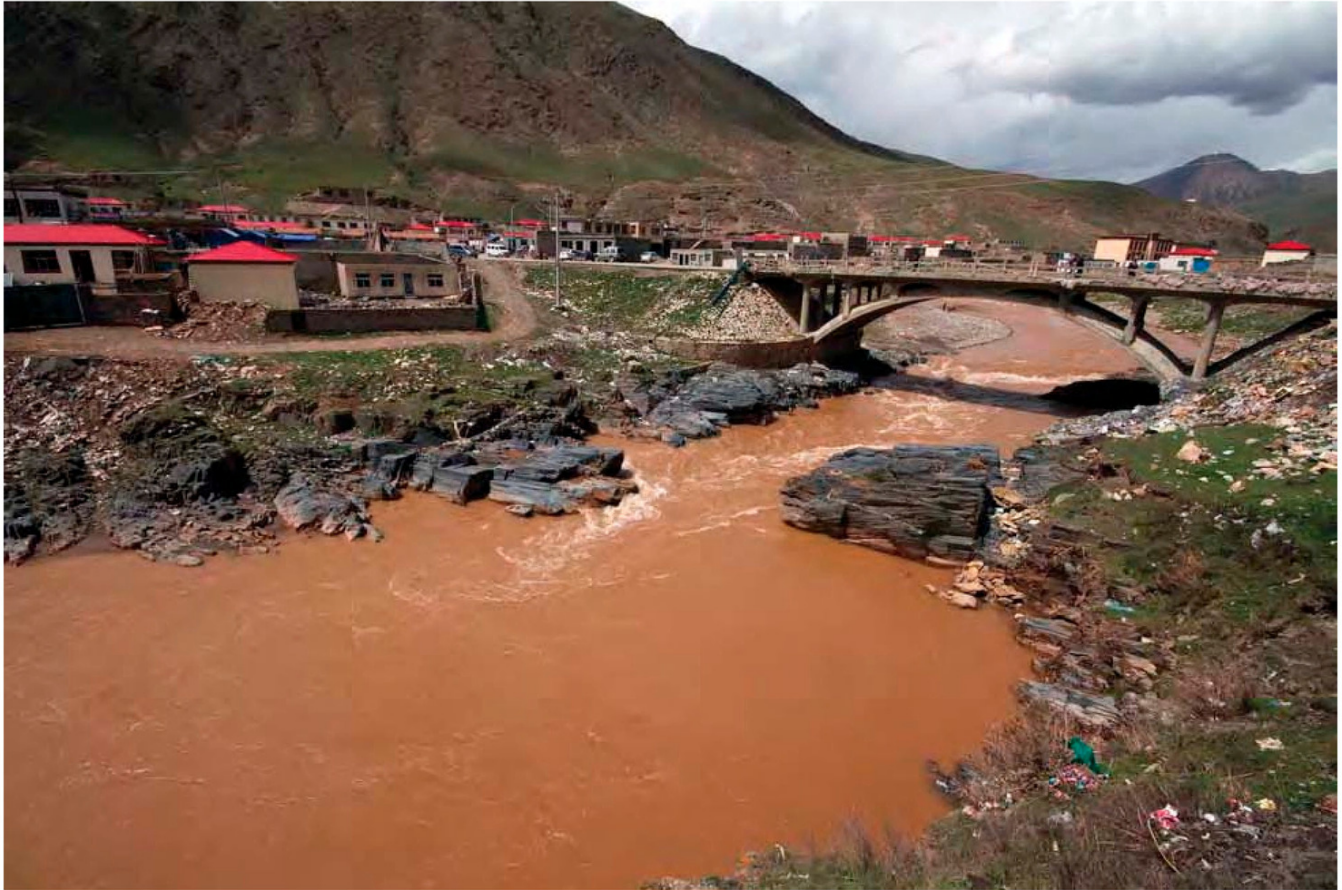
Fig. 3. The locality where the first and only Andrias was collected from Bagan, Qinghai in 1966. Today, the water is turbid and appears largely unsuitable for Andrias .