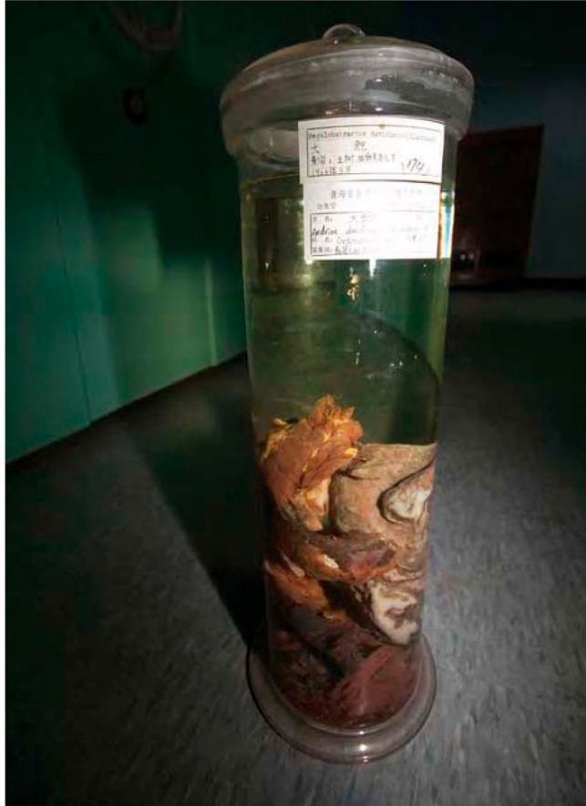
Fig. 1. The adult female Andrias captured in Qinghai, China in 1966. This specimen now resides at the Northwest Plateau Institute of Biology in Xining.

During our discussions with local people and government officials, we heard several anecdotal reports of Andrias being caught in recent years. Local Bureau of Forestry officials and one layman in Qumalai told of an adult Andrias that had been caught and thrown back by a fisherman at the same locality as the original record (Trap Locality 9, Figure 2) around 1992. The same officials in Qumalai and several officials in Zhiduo told of an Andrias that had been caught in the Nieqia River at its confluence with the Tongtian River in Qumalai (34.016, 95.817) between 1996–1997. This individual was reportedly sent to Xian and sold for food. An official from Zhiduo also reported that this fisherman's brother had caught an Andrias in a slow part of the Tongtian River between Zhiduo and Yushu earlier in 2012. Finally, two residents of Yushu reported seeing dead Andrias in the Tongtian River after the earthquake of 2010. Only one other species of caudate ( Batrachuperus tibetanus ) is