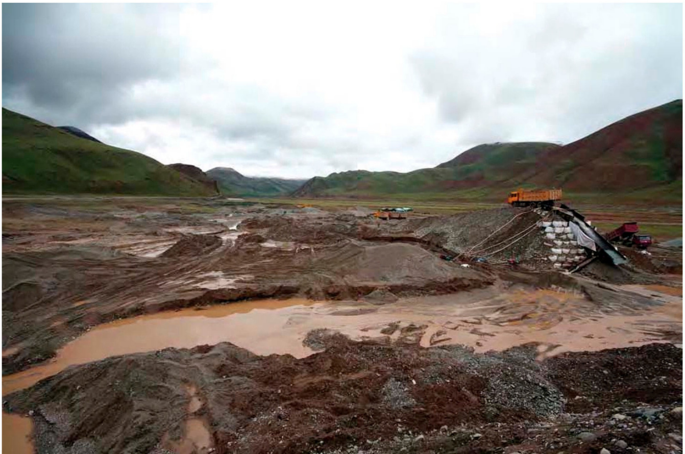
Fig. 4. A mining operation on the banks of the Tongtian River, near Qumalai, Qinghai.