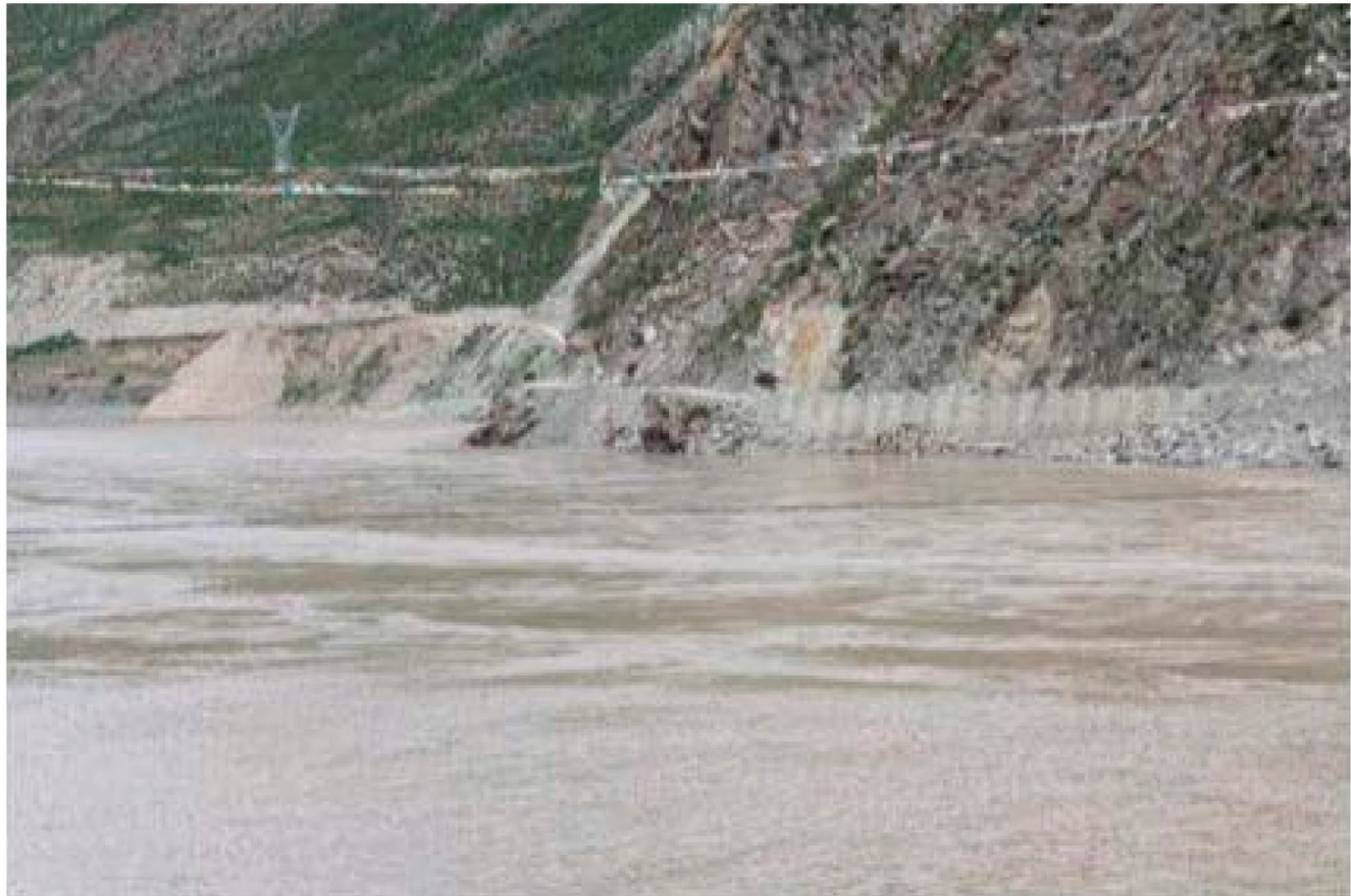
Fig. 5. Stream bank degradation caused by road construction along the Tongtian River.

covery should continue to be a top priority for Andrias conservation.