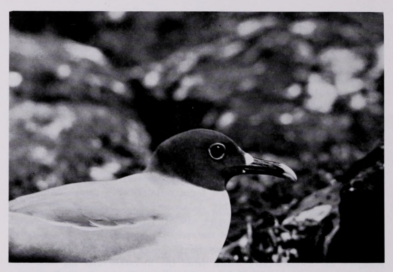
Fig. 1. Profile of an adult Larus furcatus showing the light markings on the tip and at the base of the bill. Note the enormous eye.

cliff) could be seen on or over the sea during the day. Therefore, I placed my sleeping bag at the side of the cliff on the nights of 13–14 and 14–15 November, and repeatedly set an alarm clock throughout the night so that I would awaken at least at the beginning of each hour in order to sample activity of the colony. A nearly full moon for much of both nights allowed general observation when skies were clear; activity at certain nests was checked by flashlight.