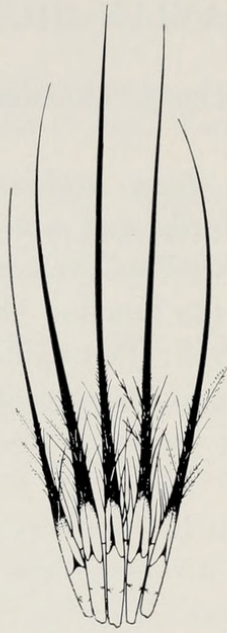
FIG. 1. Cluster of rictal bristles of the Alder Flycatcher ( Empidonax traillii ). Seven millimeters in length.

Icteridae, Corvidae, and Apterygidae (Kiwi), which are somewhat insectivorous, yet rarely, if ever (the Kiwi, never), feeding in flight, also possess well developed bristles.