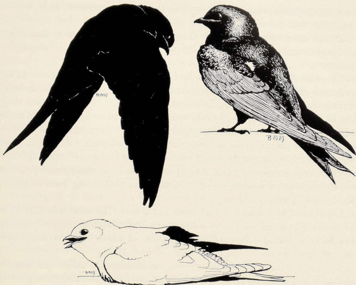
FIG. 2 (upper left). The Stooped-Submissive flight posture, a signal of defeat following a fight in male Purple Martins; abnormally uncoordinated flight and constricted rectrices are characteristic.

FIG. 3 (upper right). Male Purple Martin showing the white tuft of feathers exposed laterodorsally following scratching of the head.