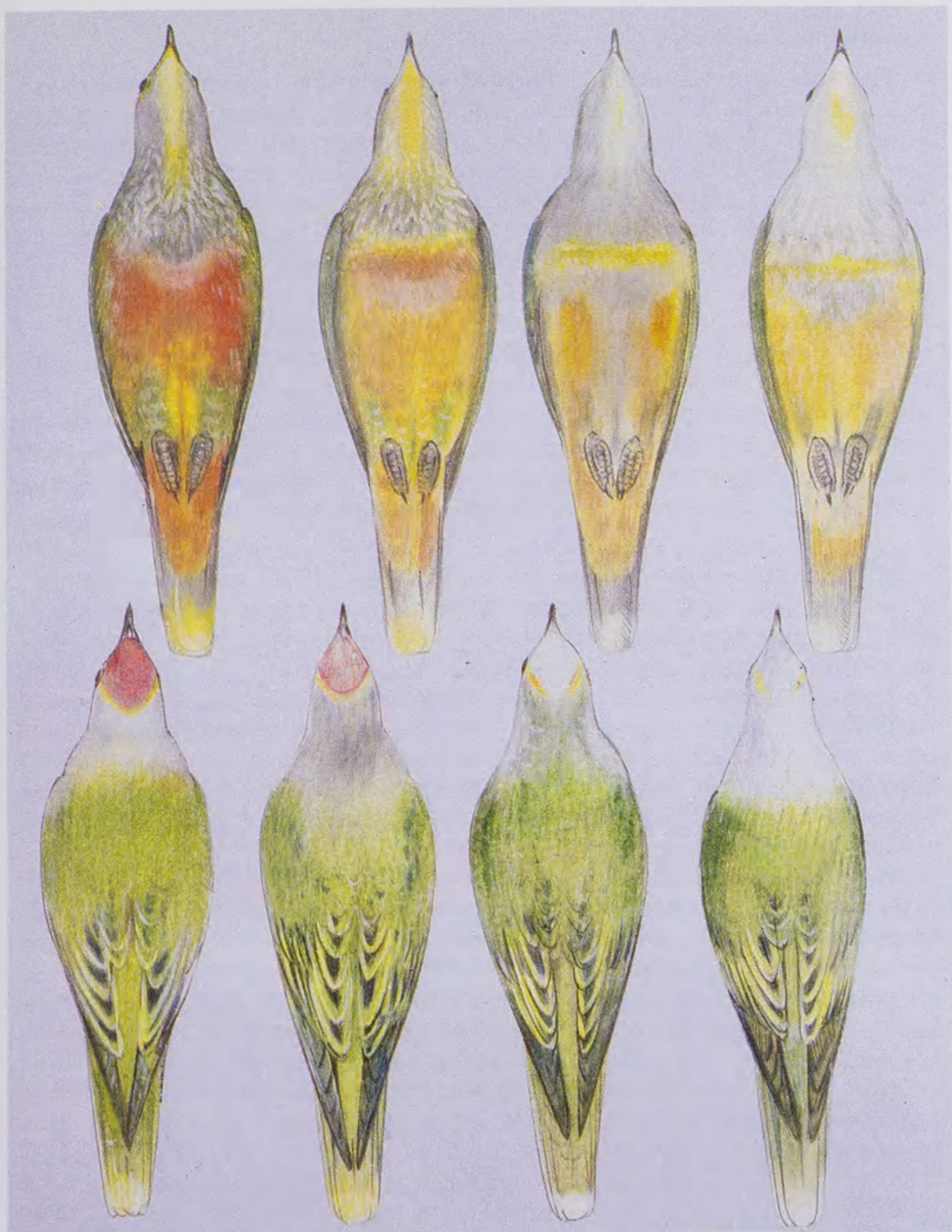
Fig. 2: Ventral and dorsal coloration in subspecies of Ptilonopus regina . Left to right: P. regina regina (CSIRO 5398 ♂ NSW); P. r. ewingii (CSIRO 6508 ♂ NT); P. r. 'roseipileum' (CSIRO 30202 ♂ Timor) and P. r. xanthogaster (CSIRO 14269 Taam Island [Kai Islands]).