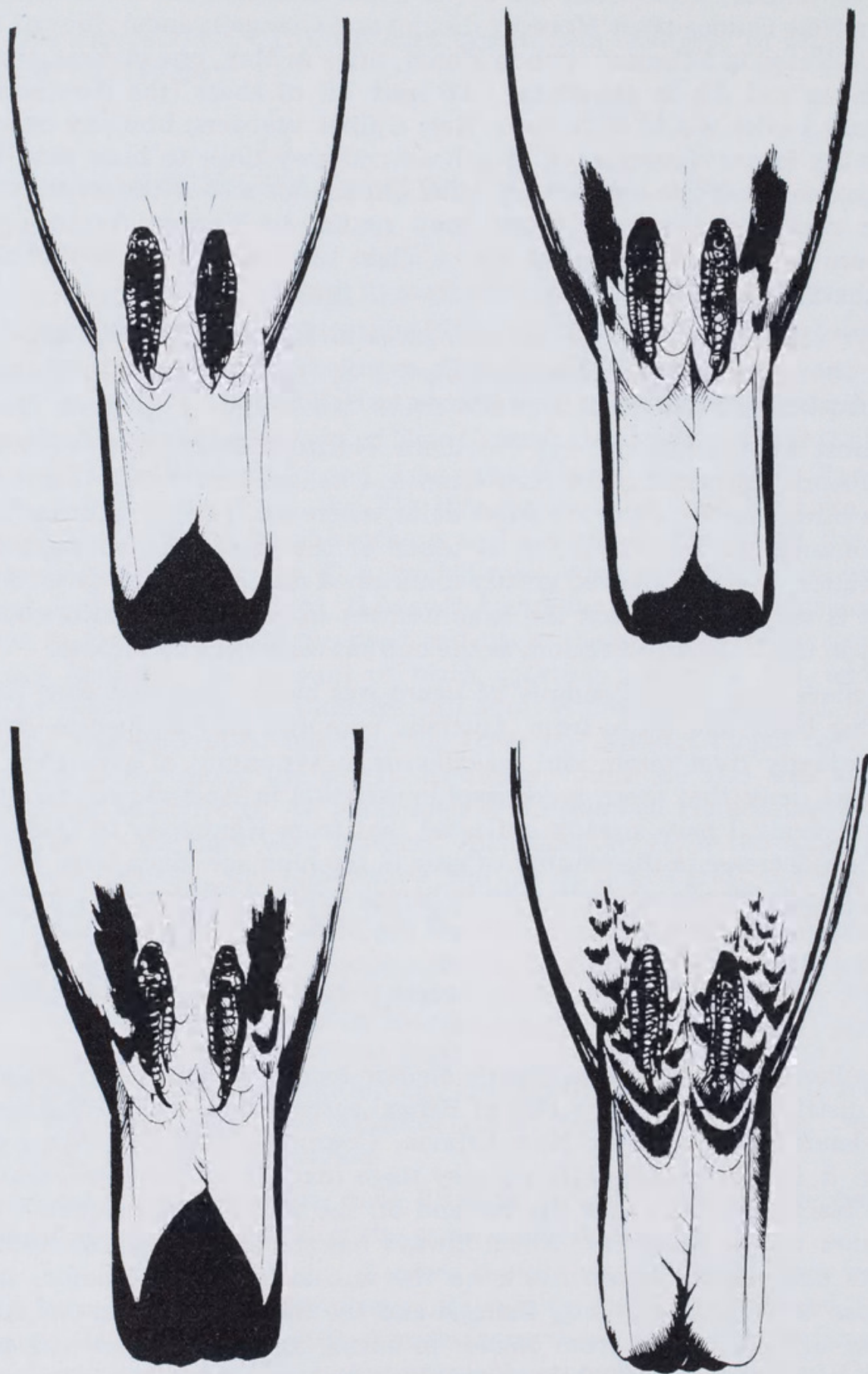
Fig. 4: Ventral coloration in subspecies of Ducula bicolor . Top, left to right: D. bicolor bicolor , D. b. luctuosa , D. b. 'melanura' and D. b. spilorrhoea .