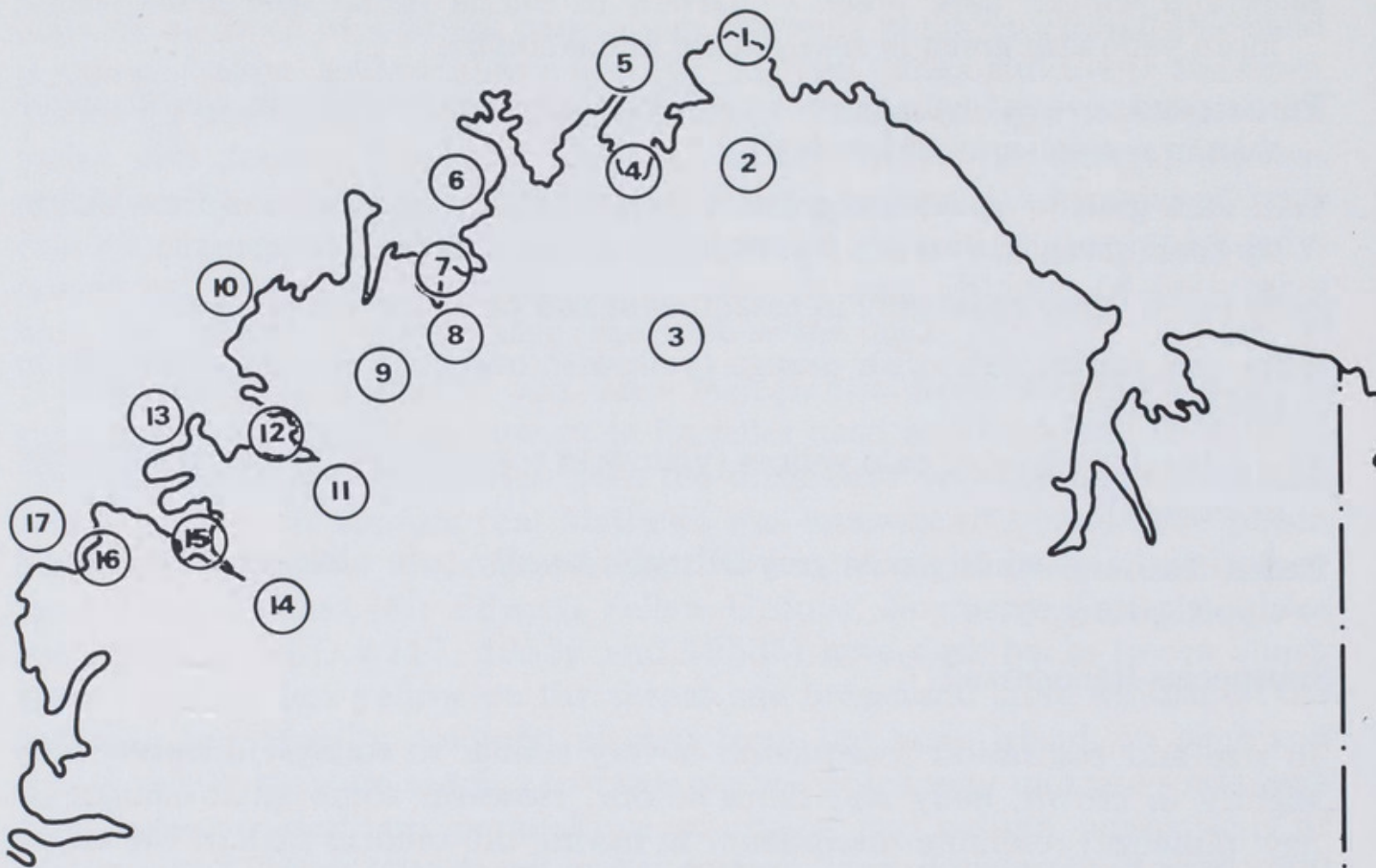
Fig. 3: Distribution of Ducula bicolor in Kimberley, Western Australia: 1 Cape Londonderry; 2 Drysdale River (National Park); 3 Morgan River; 4 Napier Broome Bay; 5 Sir Graham Moore Island; 6 South West Osborne, Carlia and Borda Islands; 7 Admiralty Gulf; 8 Lawley River; 9 Mitchell River; 10 Bigge Island; 11 Roe River; 12 Prince Frederick Harbour, Hunter River mouth and Boongaree Island; 13 Coronation Island; 14 Prince Regent River; 15 St George Basin, St Andrew Island and Byam Martin Island; 16 Kunmunya; 17 Augustus Island.

as magpies', which were no doubt Torres Strait Pigeons but the precise locality where he shot the birds is uncertain.