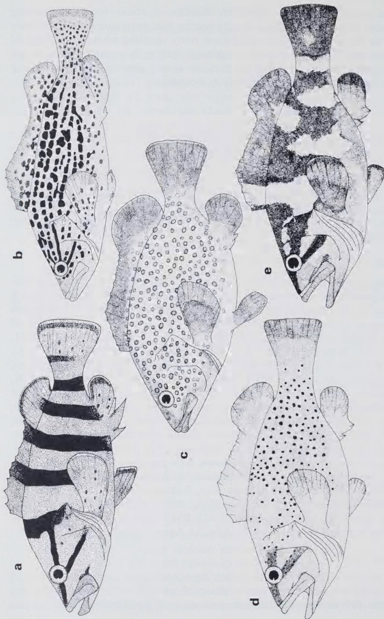
Fig. 1: Comparison of colour patterns in life of Acanthistius (measurements are approximate standard lengths): a, A. cinctus (200 mm); b, A. pardalotus (230 mm); c, A. ocellatus (210 mm); d, A. serratus , spotted colour variety (270 mm); e, A. serratus , blotched colour variety (230 mm).