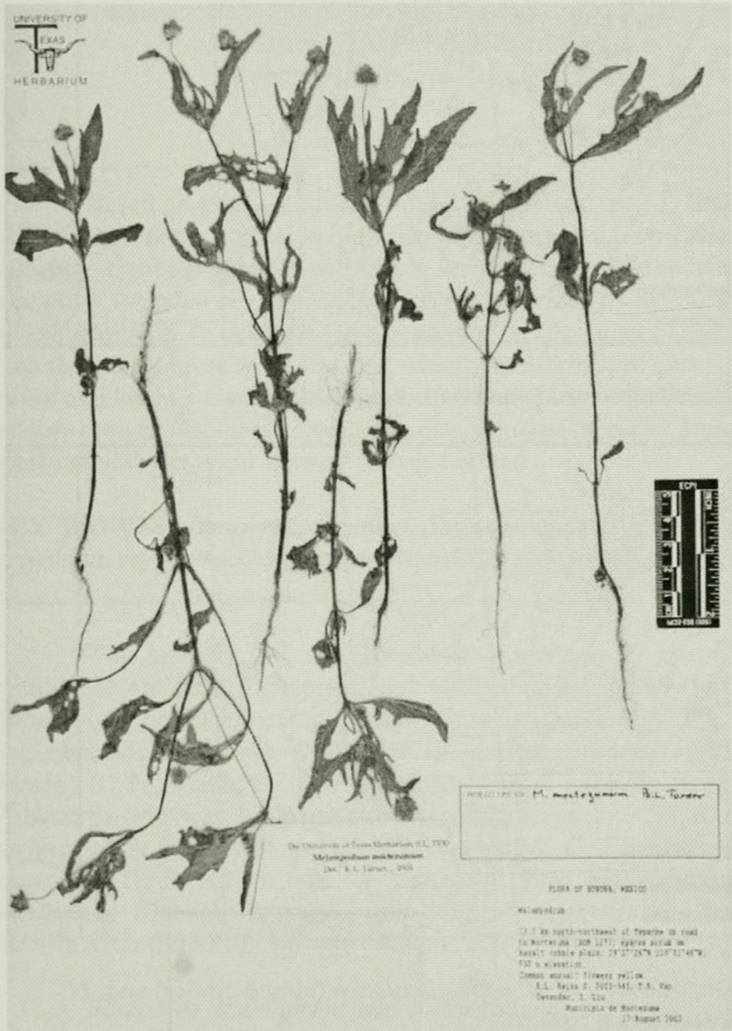
Fig. 1. Holotype of Melampodium moctezumum .

Mead, J.I. et al. 2006. Tropical marsh and savanna of the late Pleistocene in northeastern Sonora. Southwestern Naturalist 51: 226-239.