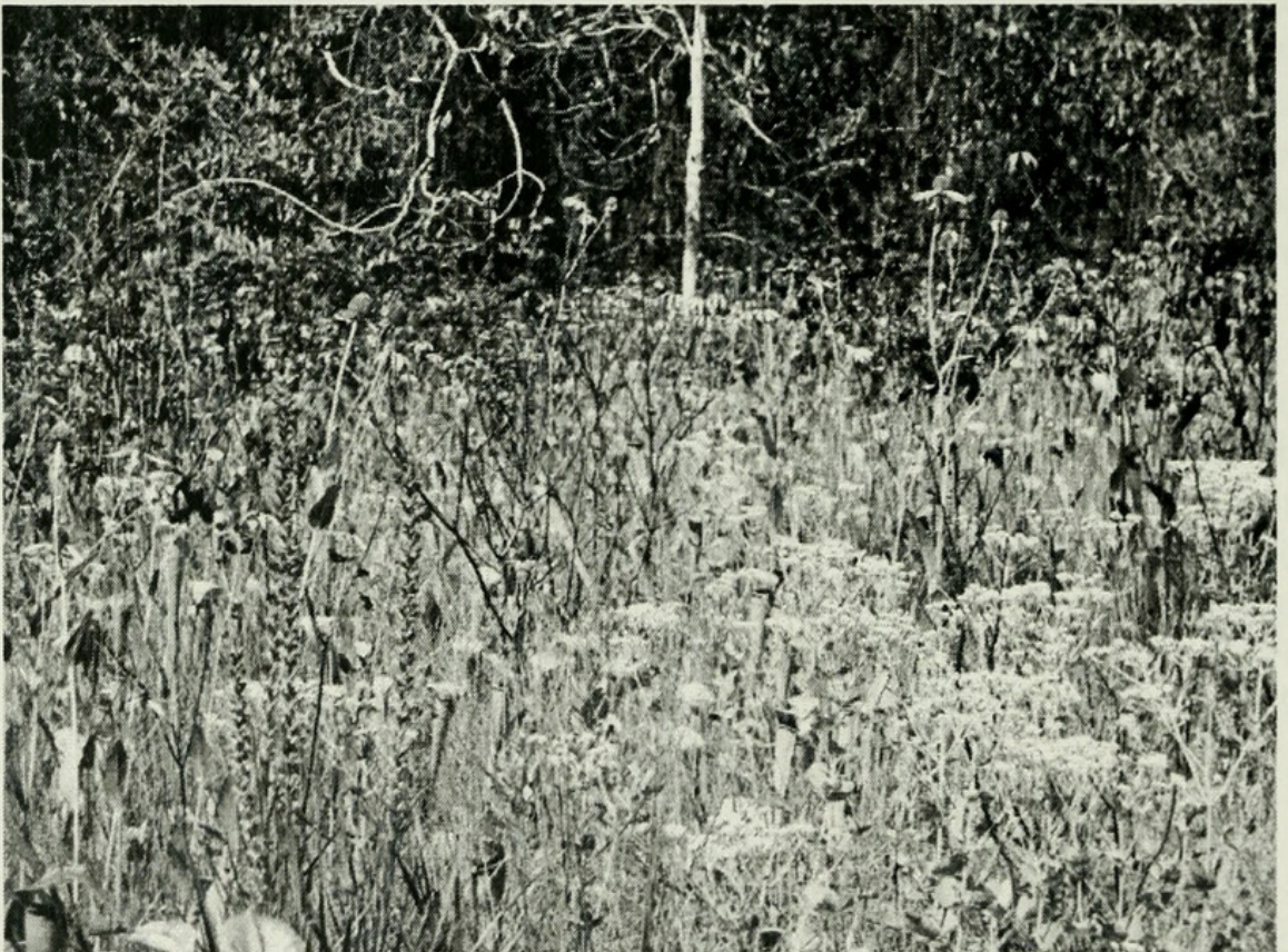
Figure 1. Shingle Branch Bog occurs within Fox Hunter's Hill

However, Fox Hunter's Hill, like the remainder of longleaf pine uplands in the West Gulf Coastal Plain, is not pristine. Pine stands are generally young, over-stocked, and even-aged; the canopy is dense, with insufficient gaps, and there is often too much shrub and mid-story woody vegetation. Forest Service records indicate that prescribed fire has been introduced mainly in the non-growing season (however, recent