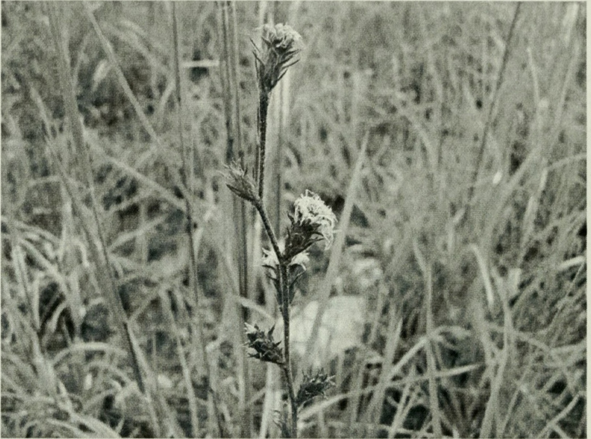
Figure 3. Liatris tenuis Shinnery

2003, when no prescribed burning occurred, Fox Hunter's Hill has been burned on a 2-3 year rotation (T. Zimmerman pers. comm.). The timing of burns alternated between fall and late winter to early spring. However, the latest prescribed burn applied to Fox Hunter's Hill occurred in May 2006 because of a desire to implement a growing season fire pattern.