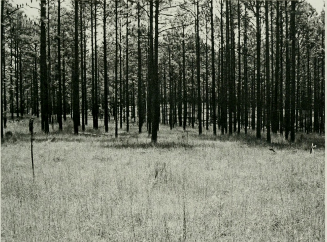
Figure 2. Upland Longleaf Community at Fox Hunter's Hill

Community types at Fox Hunter's Hill include extensive areas of arenic dry uplands, loamy dry mesic uplands, and small patches of xeric sandylands and glades. Along creeks are herbaceous seeps, particularly bogs and baygalls (Orzell 1990, Diggs et al. 2006, Van Kley 2006). High-quality longleaf pine upland is habitat for such