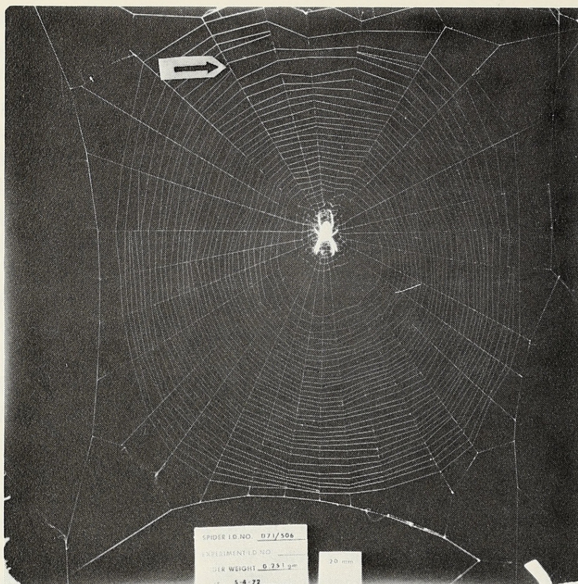
Fig. 1.—NASA photograph of web built by an adult female Araneus diadematus C1. spider in the pre-flight simulation experiment. The picture shows all the characteristics of the adult web of the species; note particularly the North/South asymmetry in the radial angle size and spiral distances, and the turning points in the spiral (arrow), which indicate the places where the web-building spider reversed directions.

Spiral size could not be measured, because the photographs do not show the outermost turns. A figure for spiral regularity can be established for pre-flight controls, and separately for the one regular in-flight web and other in-flight webs. Where there were no reference scales, the spiders of known size could be used for projecting web photographs to original size. In five pre-flight webs the spiral regularity was calculated at 0.390 \pm 0.093 West and 0.403 \pm 0.033 East. This means that distances between spiral turns varied less than 0.5 mm, indicating relatively regular spacing of consecutive spiral turns. In the one regular in-flight web the corresponding figures are 0.333 in the West and 0.69 in the East; there is no significant difference between the two sets of webs (Fig. 2). One of the irregular in-flight webs (Fig. 4) was measured showing a mean spiral regularity of 0.70 West and 0.96 East, which is significantly different from pre-flight and regular in-flight below the 5% probability level: this in-flight web had a spiral less regular than controls.