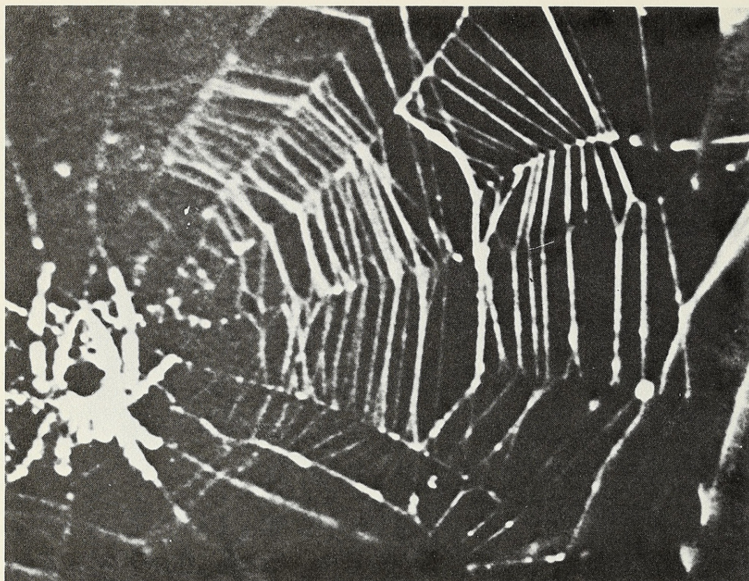
Fig. 4.—This is one of several pictures of part of a highly irregular in-flight web. Similar patterns are built on earth directly before and after a spider's molting, by old spiders shortly before death, and after a high dose of a stimulant drug like dextro-amphetamine. We can not be sure that weightlessness caused this unusual pattern. Compare to Fig. 2 which indicates that under in-flight circumstances a regular web could also be constructed.

Unfortunately we were unable to measure shape and size of webs in flight; this would have required a camera with a wide-angle lense, or more distance between camera and web than was possible. However, there are close-up photographs of threads spun before and during flight. Evaluation of diameter suffers from uncertainty about which threads are photographed. If we assume that we measured on the pictures comparable threads in- and pre-flight—i.e., radii or draglines—the Skylab spiders laid some 20% thinner threads than the same animals on earth. Such a result is particularly interesting when one compares it to thread thickness measurements by Christiansen et al. (1962), performed on spiders which carried extra weight. Under that condition, which may be considered opposite to the weightless spiders in Skylab, thread thickness was found increased over lighter controls.