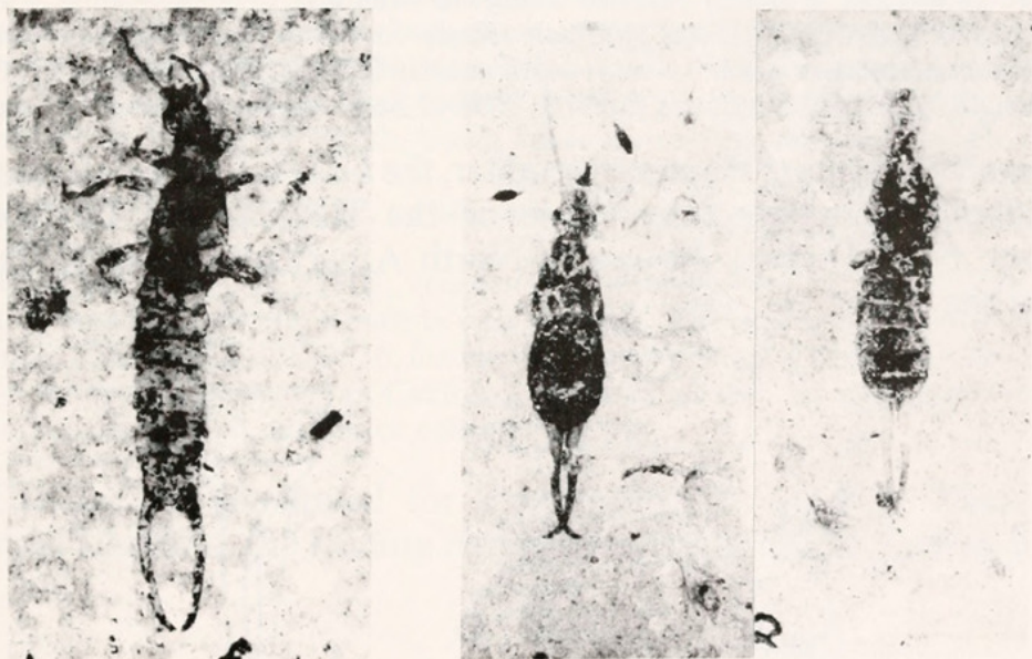
Fig. 1. Left: holotype Labiduromma gurneyi , n.sp.; center: holotype L. scudderi , n.sp.; right: paratype L. scudderi n.sp.

While preparing a revision and catalogue of fossil Dermaptera for the "Natural History Inventory of Colorado," we set aside several specimens that clearly were not any of the species Scudder had described. Since no one else has described fossil Dermaptera from the Oligocene in North America, these specimens represent currently unnamed species. The specimens represent two distinct species. Both appear to be best placed at this time in Scudder's genus Labiduromma (Labiduridae). One of the species falls into the avia group and the other into the commixtum group of that genus.