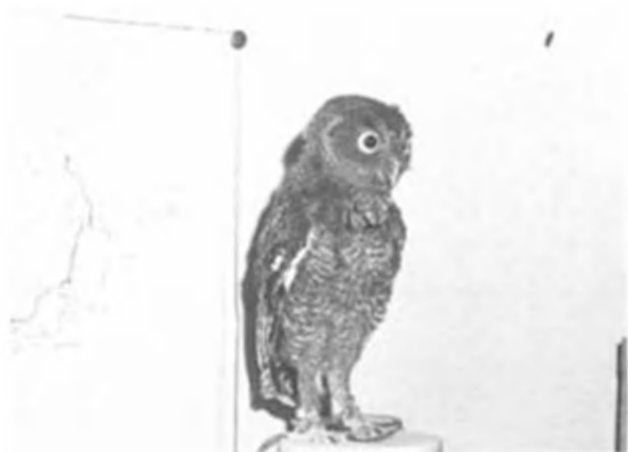
Figure 3. Upright inquisitive stance of juvenile Eastern Screech-Owl.

1962) posture and fright reaction (Catling 1972) in Aegolius are more frequently observed in approach situations. However, there are also numerous reports of wild Saw-whet Owls allowing very close approach by humans with the owls showing no signs of either defense or escape (Wilson 1931, Bent 1938). The FUBB display may be utilized in situations when easy escape is not an option. This would account for the FUBB display not being seen in newly captured birds but only in ones that had adjusted to captivity and their inability to escape. In support of this, a female Saw-whet Owl cornered in a nest box (Santee and Granfield 1939) showed the fluffed out breast feathers typical of the first stage of the FUBB display; the bird subsequently left the box without any other FUBB components being noticed. Michael and Michael (1928) reported a Saw-whet Owl perched just inside the opening of a nest cavity to emit a buzzing vocalization which resembled "the sizzling of water on a hot stove" when startled. However, this was certainly the begging vocalization of a nestling (R. J. Cannings, pers. comm.) rather than an adult vocalization as suggested by Michael and Michael (1928). No FUBB components were noticed in other captive Saw-whet Owls even when stimulated to the point of attack (Schaeffer 1973). Further field studies of wild owls may help verify the exact function and context of this display.