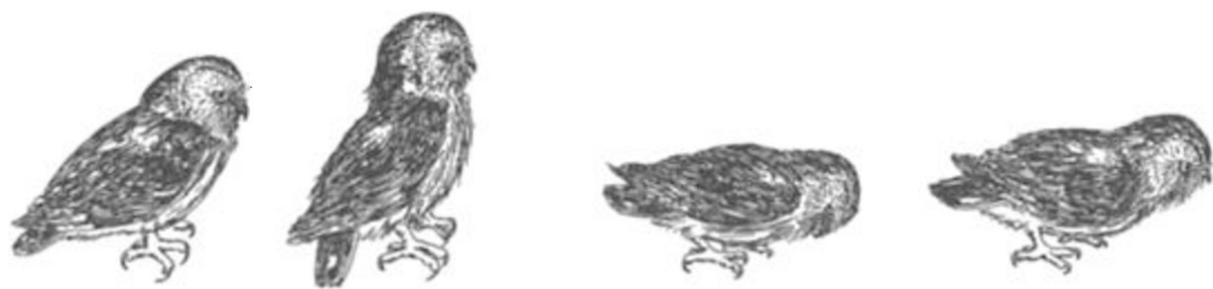
Figure 1. The complete fluff up, bow, buzz (FUBB) display sequence of the Saw-whet Owl. From left to right, resting pose, feather fluff and upright stance, bow, and bow with raised head when buzz is emitted.