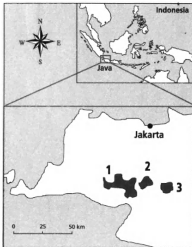
Figure 1. The study areas: 1 = Halimun, 2 = Mt. Salak, 3 = Gede-Pangrango.

Mt. Salak. This mountain is a volcano 2211 masl, well vegetated to the top (Fig. 1). The area of forest containing Javan Hawk-Eagle has been estimated to 10 000 ha (van Balen et al. 1999). The forests have administrative