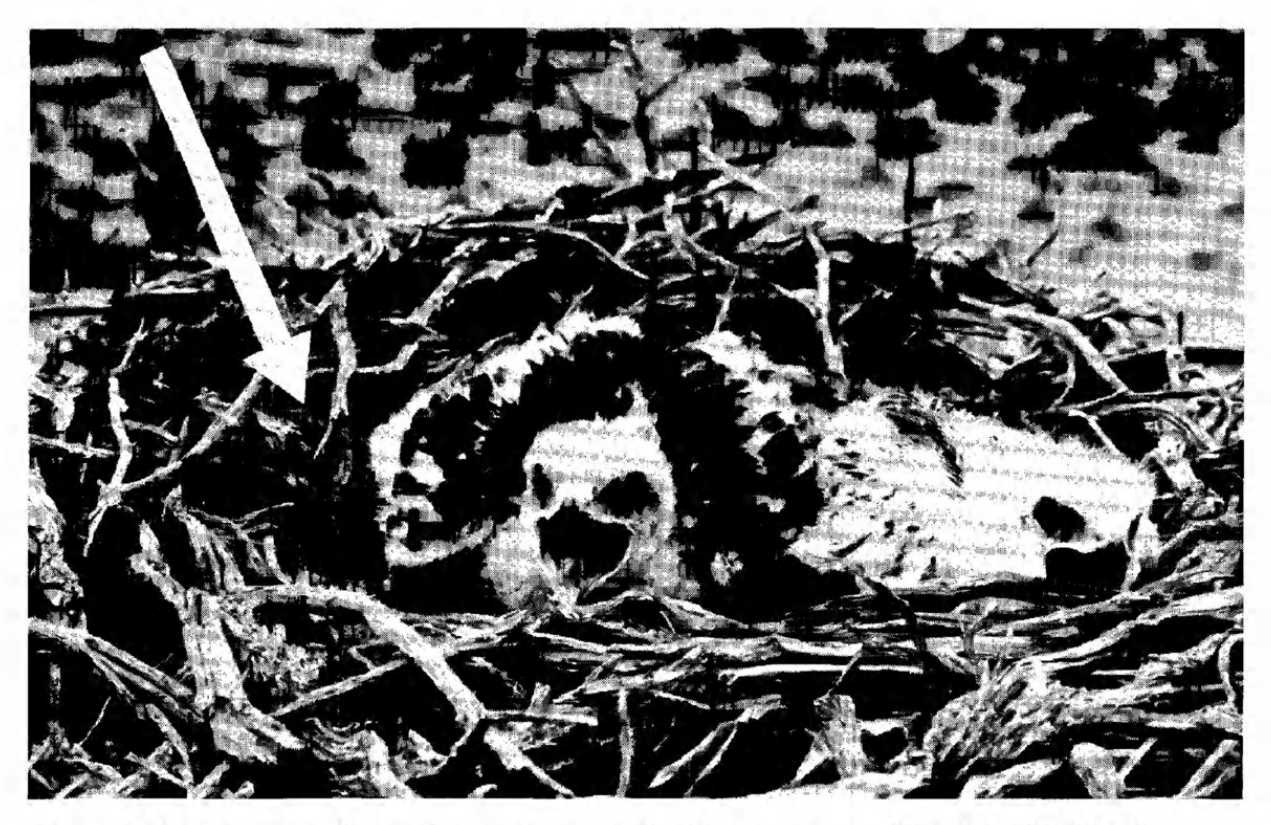
Figure 2, Ferruginous Hawk nest showing 1.3 cm steel cable interwoven with coarse sticks in nest.