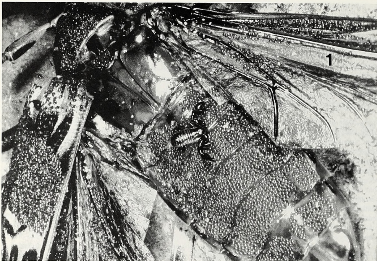
Figure 1.—Harlequin beetle with elytra opened to display female Cordylochernes scorpioides and unusually heavy infestation of mites.

never found individuals of these species under the elytra of harlequin beetles ( N = 149 beetles).