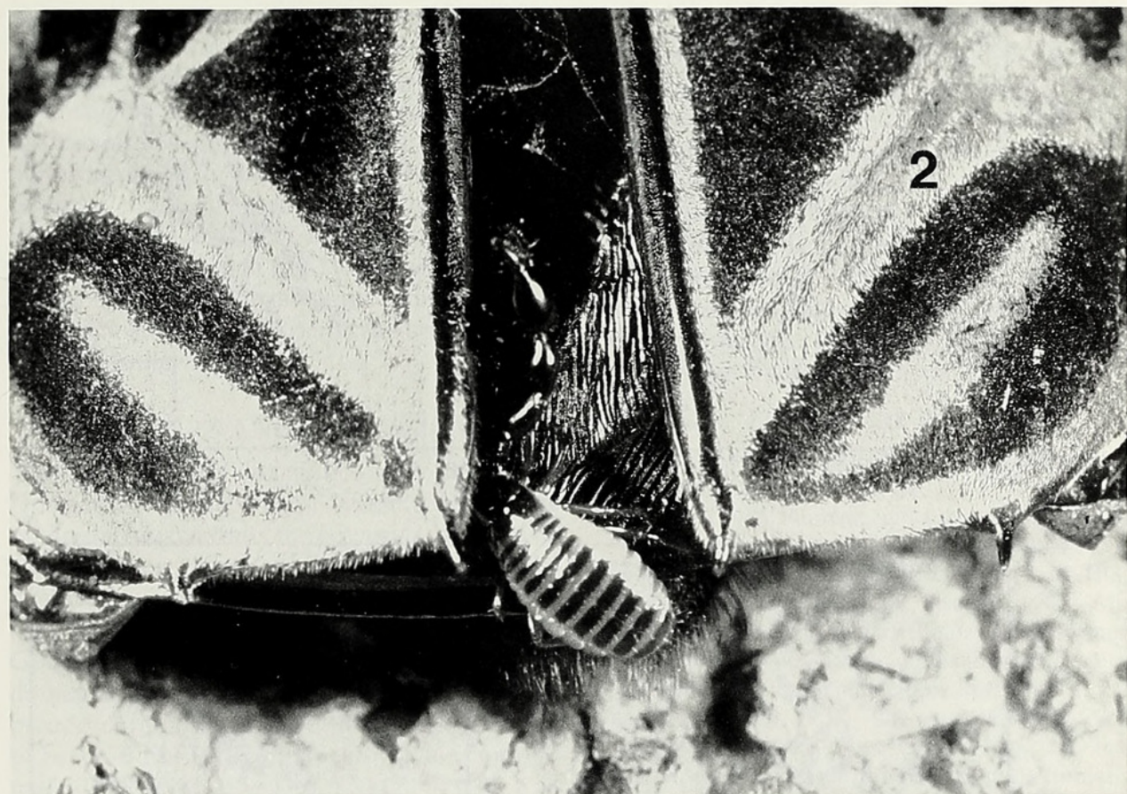
Figure 2.—Beetle-boarding behavior of C. scorioides (see text).

Soberania. Eight female and 61 male pseudoscorpions were removed from 58 harlequin beetles taken from 7 newly-fallen, undecayed trees. Sixty-nine female and 100 male C. scorioides were also collected from 16 tree populations in the area. In French Guiana, 30 females and 54 males were removed from 34 beetles collected from 3 newly-fallen trees along the Piste du Kaw, 50 km southeast of Cayenne. An equivalent number of males and females was collected from 12 sympatric tree populations. Two interrelated factors confound a direct comparison of the mean abdomen length of beetle-riding versus within-tree pseudoscorpions. First, although abdomen length varies with nutrition, there are also significant positive correlations between abdomen length and sizes of pedipalpal and cephalothorax traits. Second, for our analysis, it was particularly critical to take account of these correlations. Male pseudoscorpions compete to establish mating territories on the abdomens of beetles and, as a consequence, beetle-riding males are significantly larger overall than males randomly-sampled from trees (Zeh & Zeh 1992). Therefore, even in the absence of