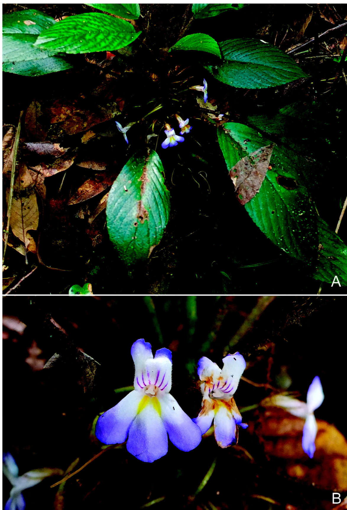
Fig. 1. Billolivia moelleri D.J.Middleton. A. Habit. B. Flowers. From Leong-Škorničková et al. JLS-2623.