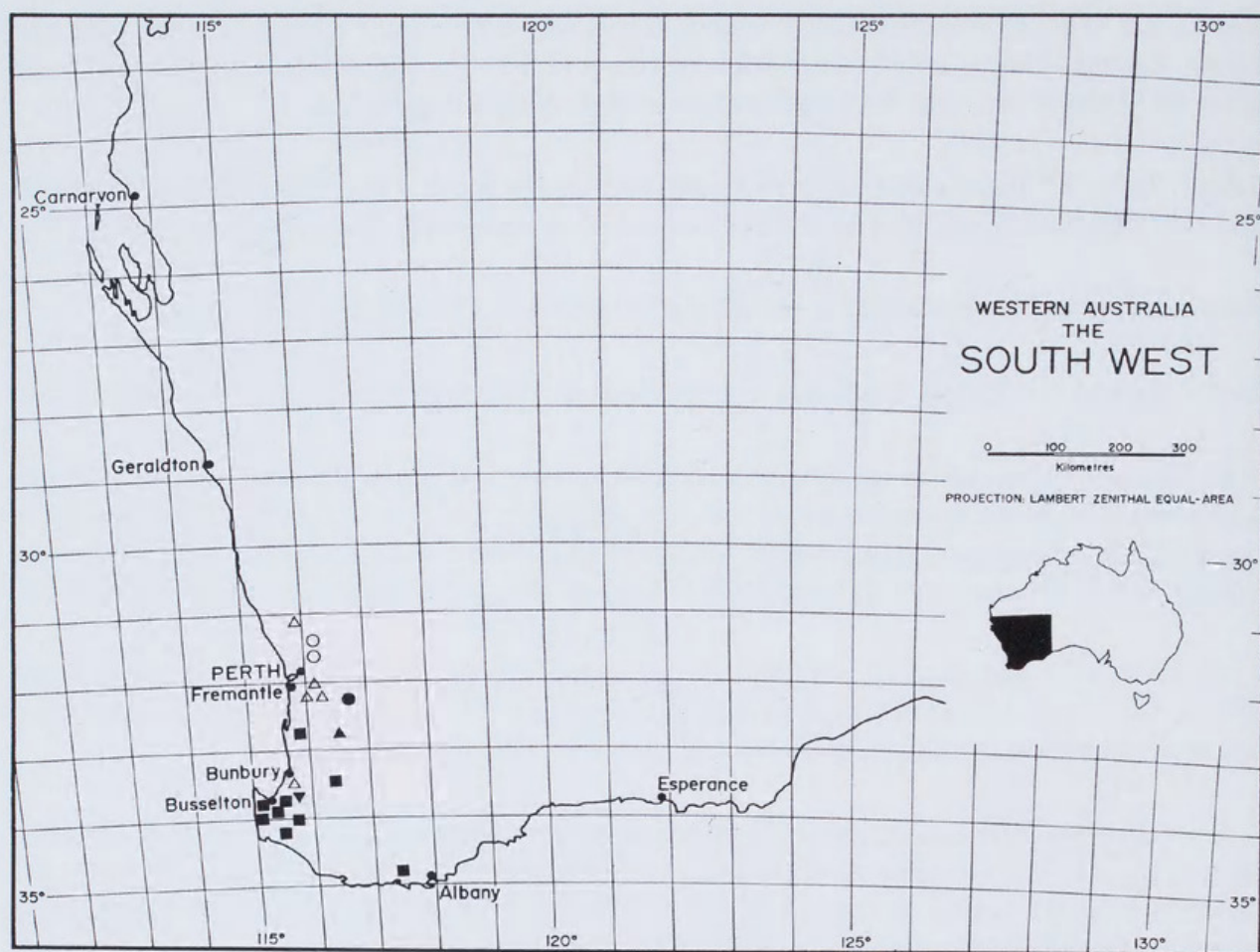
Figure 2. Distribution of Hibbertia glomerata subsp. glomerata ■; Hibbertia glomerata subsp. darlingensis △; Hibbertia glomerata subsp. ginginensis ○; Hibbertia glomerata subsp. wandoo ●; intermediate variant with stamen bundles fused only basally ▼ and intermediate variant with free stamens ▲.