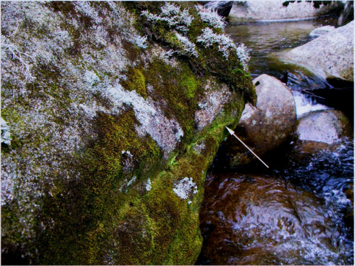
Fig. 2. Habitat of Triandrophyllum subtrifidum var. subtrifidum (arrowed) in the West Tyers River.

to the ventral side of the stem, incubous, becoming larger towards the shoot apex; deeply divided into 2 or 3 lobes, the number of lobes apparently random; cells mostly isodiametric or slightly longer than wide, typically 25–35 \mu\text{m} wide in mid-leaf but longer (to about 2 x 1) in the leaf base and smaller and squarer on the leaf margins, with thick walls and small to medium trigones. Underleaves similar to the leaves but slightly smaller, to about 1 mm long, spreading from the stem at a small to large angle; cells similar to those in the leaves. Oil bodies \pm globular, of grape-cluster type, slightly brownish in transmitted light, 0–several per cell. Surfaces of stem, leaves and underleaves striolate, the striolae becoming shorter in the leaf and underleaf lobes. Androecia and gynoecia not seen.