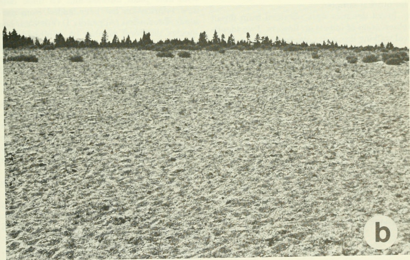
Fig. 1. (a) Typical aspect of Astragalus monoensis habitat prior to grazing. Big Sand Flat, June 1980. Plants in foreground are primarily Lupinus duranii . (b) Same view following grazing by domestic sheep.