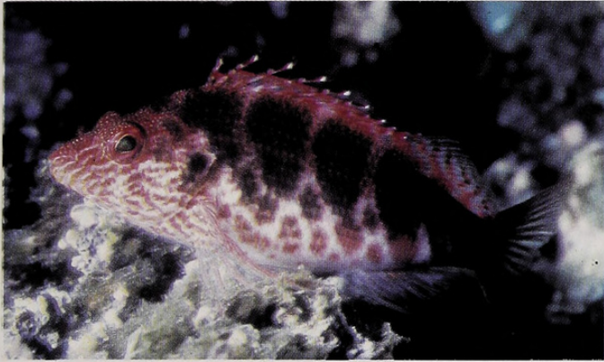
Fig. 3. Underwater photograph of Cirrhitops mascarenensis , Mauritius.

Colour of holotype in alcohol pale yellowish brown with five, slightly oblique, faint dark bars below dorsal fin that extend about half way down on body; first dark bar merging dorsally with dark area on nape; pale interspaces on body about half width of dark bars; a large oblique, oval, darker brown spot anteriorly on caudal peduncle; a dark brown spot nearly as large as eye posteriorly on opercle; fins pale yellowish.