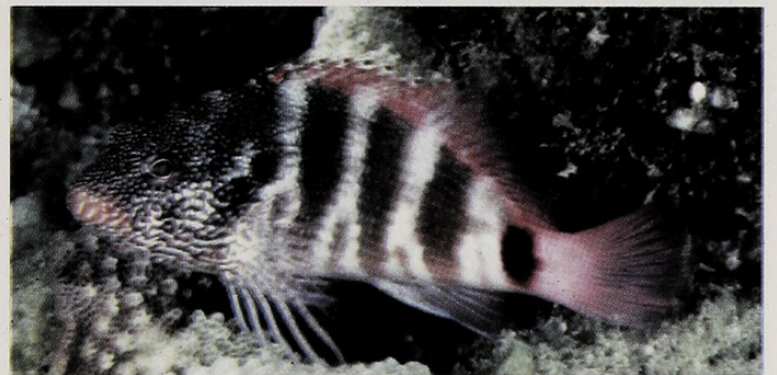
Fig. 4. Underwater photograph of Cirrhitops fasciatus , O'ahu, Hawaiian Islands.

Genetic distances between Cirrhitops and the outgroup, Amblycirrhitus bimaculatus (cytochrome b , d = 0.20 ; cytochrome oxidase, d = 0.18, 0.21 Hawaii and Mauritius, respectively) were high. Phylogenetic analyses converged on a single tree topology for both mitochondrial markers and using two methods of analysis (Fig. 5). High bootstrap values (99–100) reflect strong differentiation between Mascarene and Hawaiian specimens.