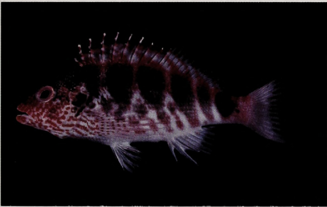
Fig. 2. Holotype of Cirrhitops mascarenensis , BPBM 20207, 59 mm SL, Mauritius.