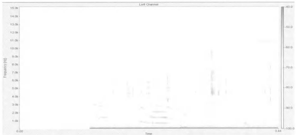
FIG. 2. Spectrogram of repeated signals from at least six C-CORE mechanical alarms (vertical broadband signals between 2-12kHz), three Dukane 'Netmark' alarms (horizontal tone burst at around 11 kHz) and humpback song components off the Gold Coast. C-CORE and Dukane alarms were on a net 100m from the hydrophone, and possibly another further away. Location of the calling whale was not known.

analysed using 'Spectra Plus' acoustics software with an AWE-64 sound card at a sampling rate of 44,100Hz, with a Fast Fourier Transform (FFT) of 1,024 points and a filter bandwidth (FFT bin width) of 43.07Hz. When measuring the levels of the fundamental frequencies of the alarms, no correction was made for the filter bandwidth because of the sinusoidal character of the signals. Sound pressure levels (SPL) were expressed as dB re 1 \mu Pa. The analysis system was calibrated with a Tektronix TDS-210 digital oscilloscope with an FFT spectrum analyser module.