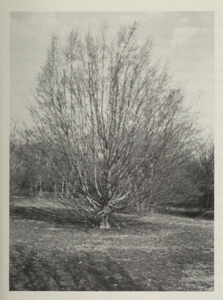
Eastern hop hornbeam (Ostrya virginiana) growing in a sunny location.

root system that is better able to support the newly planted tree.