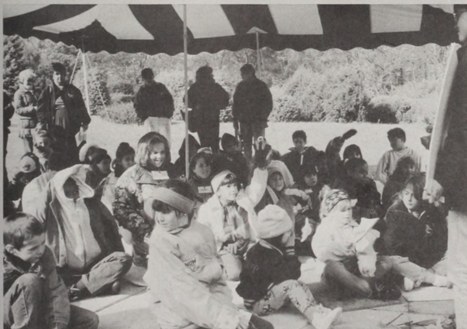
With the Hunnewell Visitor Center closed for renovations, participants in the Arboretum's Field Study Experiences Program enjoyed temporary quarters under a tent in the fall landscape.