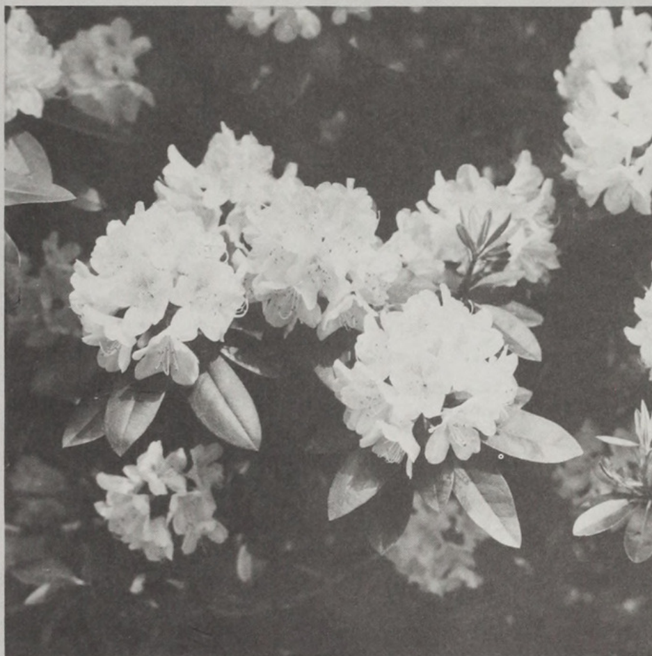
Rhododendron 'Album Elegans'

For over a decade the Arboretum has struggled to justify the annual expenditure of approximately $150,000 for the maintenance of the land and buildings of the Case Estates, which was donated to the Arboretum nearly half a century ago. Located ten miles from our living collections in Jamaica Plain, the Estates was used many years ago as a suburban nursery for plants propa-