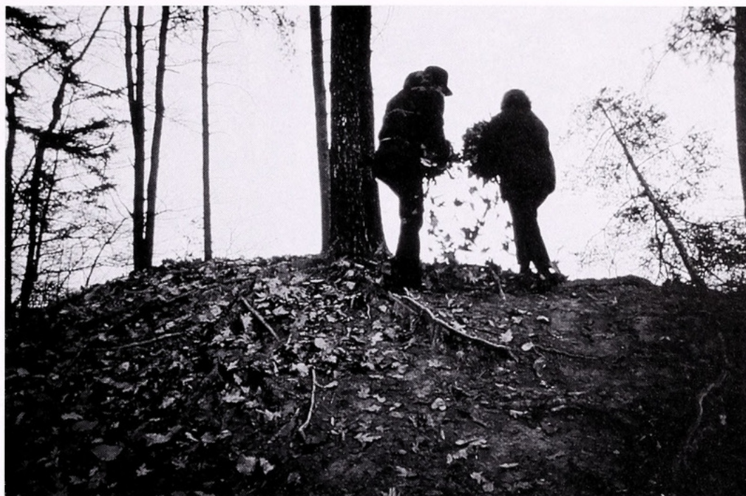
A thin mulch of raw leaves enriches the soil and promotes the growth of new wood.

self-reinforcing cycle can be seen when aquatic systems fill with algae. 4 Each shift in the soil character will in turn ripple through the entire system. Unfortunately, in many woodlands that look mature because they have larger trees, there is a lag in the succession of the soil, which may still be dominated by earthworms and bacteria and impoverished in terms of types of fungi, invertebrates, and other, more efficient paths for nutrient cycling.