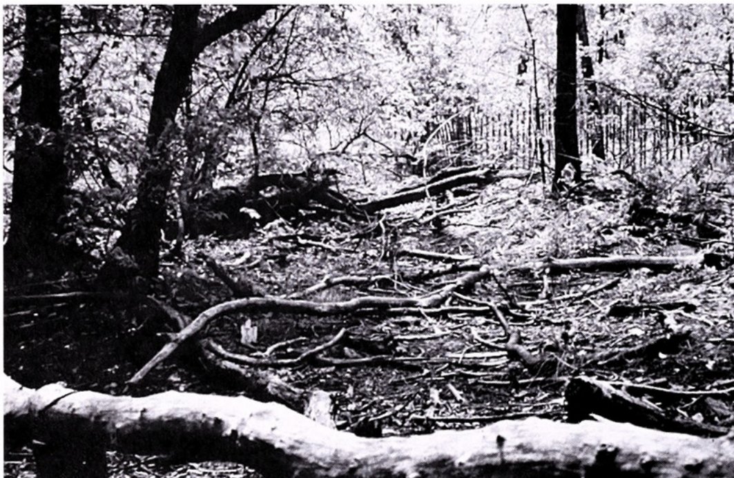
Logs laid on the ground disappear quickly. Using them as seedbeds for planting avoids soil disturbance while enhancing survival.

scapes. Earthworms in general increase soil fertility by initiating the breakdown of organic matter, aerating and mixing the upper soil, and creating a microenvironment that stimulates the bacteria that convert ammonium to nitrate. High earthworm populations also foster nitrification by supplying the oxygen necessary to convert ammonium to nitrates. They take a system already disturbed by added nitrogen and push it farther from normal by consuming the litter layer five times as rapidly as fungi and converting excess food into nitrate. The same kind of