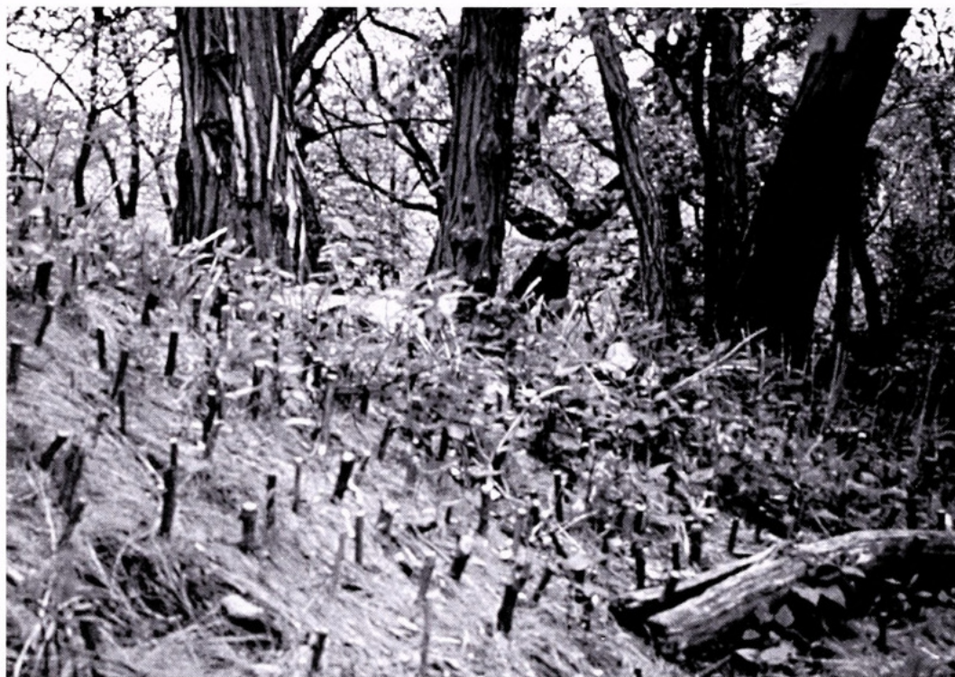
Vertical stakes made from cut branches driven into compacted ground in a dense pattern convey water and moisture downward into the root zone. They loosen the surface as they decompose, without disturbing the stability of the surface.

tend to foster the rapid growth of bacteria, which in turn generate exopolysaccharides, which cause the soil to slump in rain. Other substances make soil hard to wet, or hydrophobic. Cultivating soil is almost always deleterious to natural areas and constantly resets the