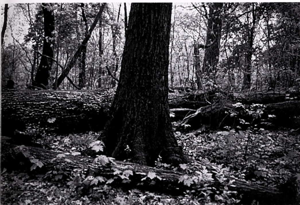
Ancient forests are filled with dead wood. Downed trees can be important assets for re-creating mixed-age, mixed-species forests.

down. Bacteria and fungi take up the nitrogen as they decompose soil organic matter, and some fix atmospheric nitrogen. This nitrogen too is released into the soil to be again available to plants. Nitrogen's slow release from an organic to an inorganic form, which is available to plants, is called "mineralization."