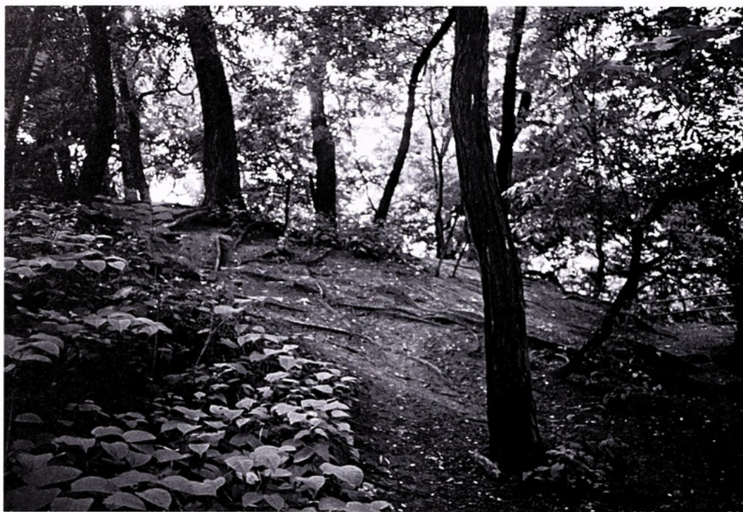
Trampling and stormwater runoff prevent reproduction of the next generation of forest in many parks.