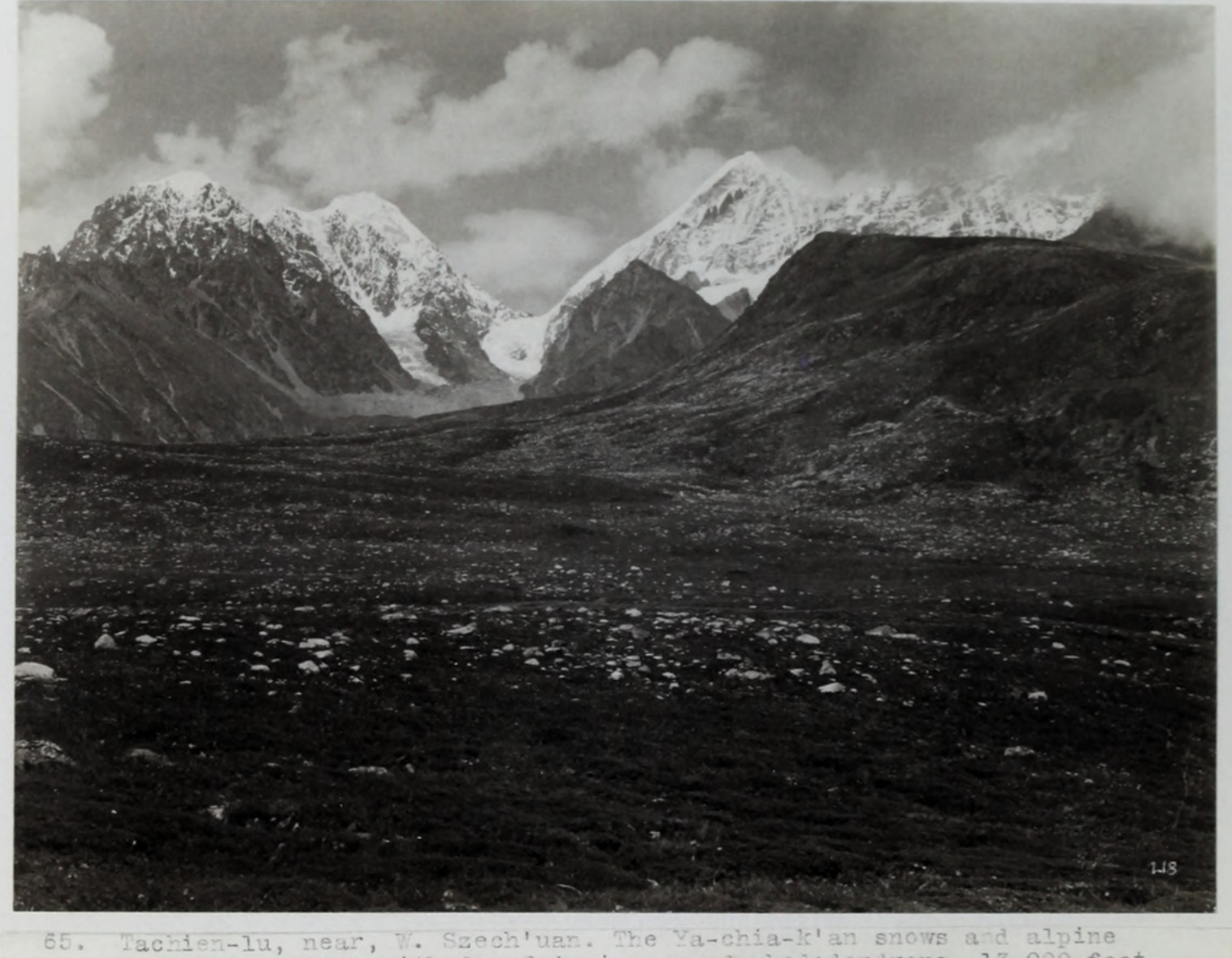
regions clothed with dwarf junipers and rhododendrons. 13,000 feet. July 19, 1908.