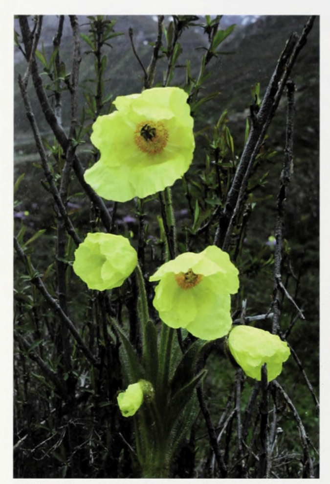
Finding the lampshade poppy ( Meconopsis integ rifolia subspecies integrifolia ) was the principal objective of Wilson's second trip to China.