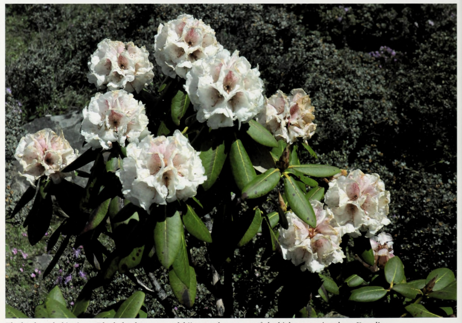
The hardy and ubiquitous Rhododendron prezwalskii covers huge areas of the high mountains above Kangding.

I write to remind you of the very great importance of the photographic business in your new journey. A good set of photographs are really about as important as anything you can bring back with you. I hope therefore you will not fail to provide yourself with the very best possible instrument irrespective of cost.