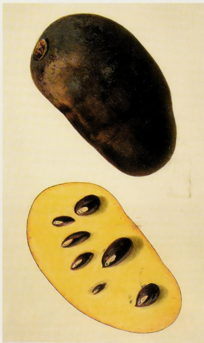
Illustration of the exterior and interior of a pawpaw fruit painted by Royal Charles Steadman in 1924.

There was an increased interest in growing pawpaw as a crop at the beginning of the twentieth century; for example, in 1916 the American Genetic Association offered a $100 prize—$50 for the largest individual pawpaw tree and $50 for the tree—regardless of size—with the best fruit (American Genetic Association 1916). Yet in spite of its high potential through the years as a new high-value niche fruit crop, pawpaw is still only in the early stages of commercial production. The greatest current market potential for pawpaw is probably in local markets and direct sales to restaurants and other gourmet niche customers. Most pawpaw fruits are