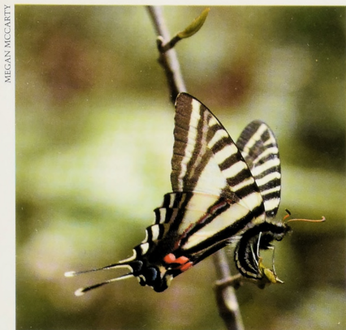
A female zebra swallowtail oviposits on an emerging pawpaw leaf.