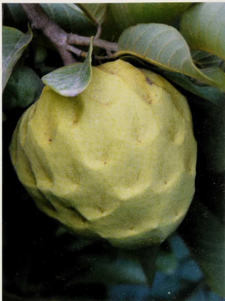
The fruit of cherimoya ( Annona cherimola ).