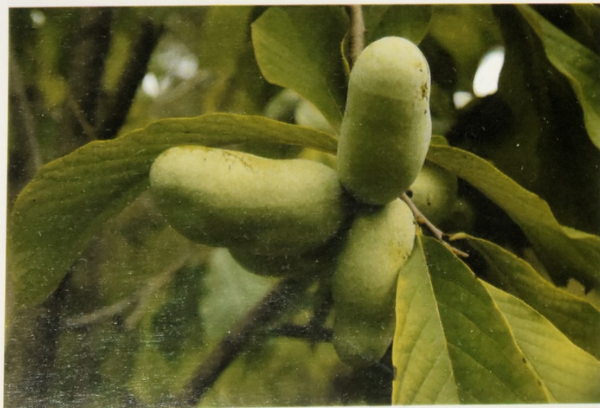
Flowers, foliage, and fruit of pawpaw.