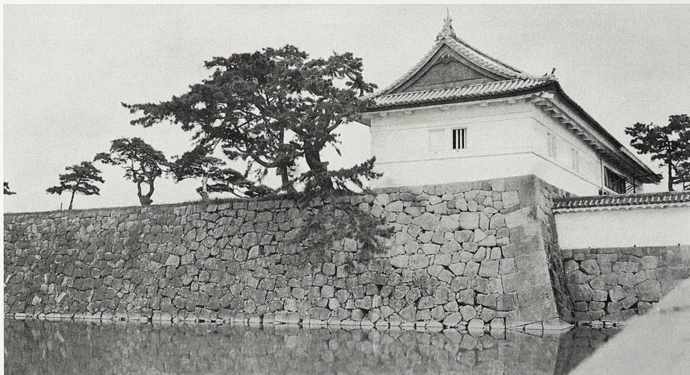
Japanese black pine ( Pinus thunbergii ) grows above the wall and moat surrounding the Imperial Palace in Tokyo, Japan, in this John Jack photo from August 19, 1905.

The library has digitized a collection of John Jack's photographs from Japan, which are available at http://via.harvard.edu . A short introduction is available on the Library website: http://arboretum.harvard.edu/library/image-collection/botanical-and-cultural-images-of-eastern-asia/john-george-jack/