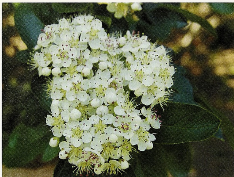
× Sorbaronia jackii