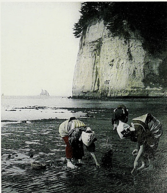
In addition to making his own photographs in Asia, Jack also purchased colored lantern slides to use in his lectures. Seen here are two lantern slides from Japan showing people under a wisteria-covered arbor (left) and women digging shellfish on a beach (right).