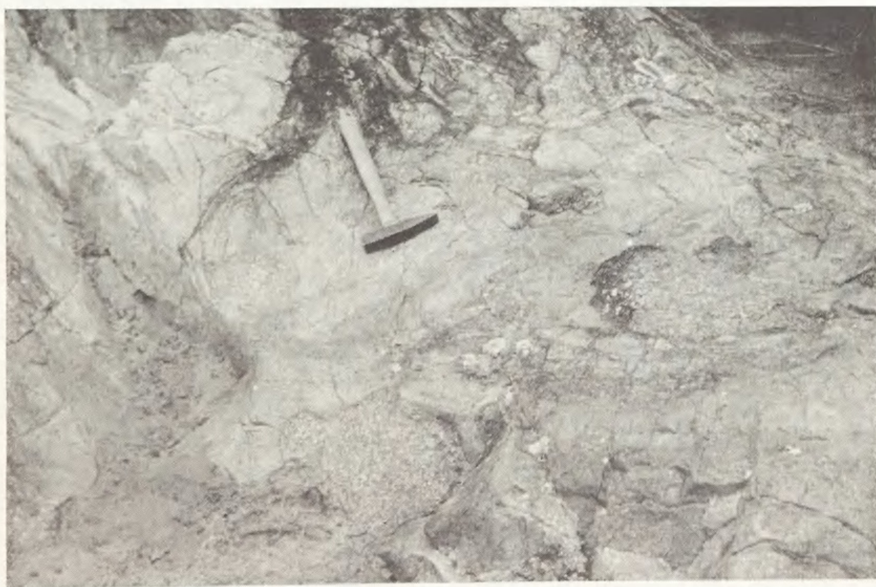
Rounded boulders of granite embedded in "Porphyry"—Campbell's Nob.