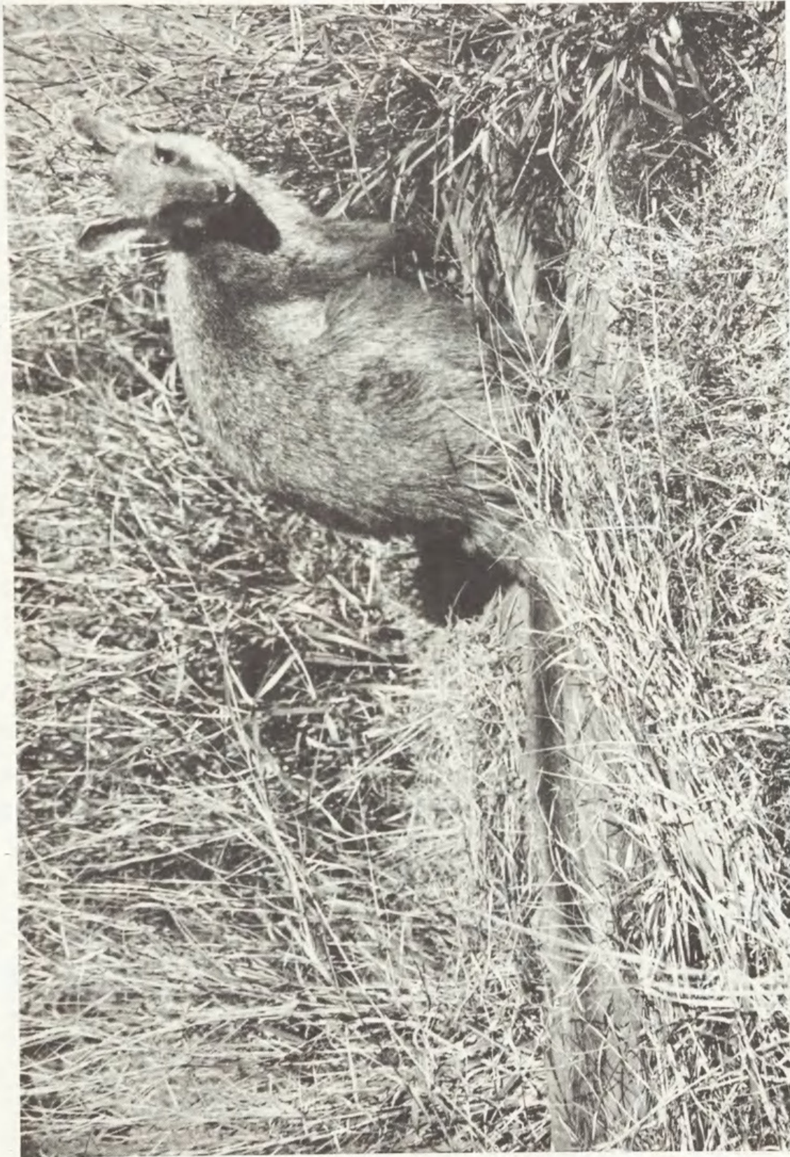
The Brush-tailed Rock Wallaby, Petrogale penicillata Griffith, Smith and Pidgeon.