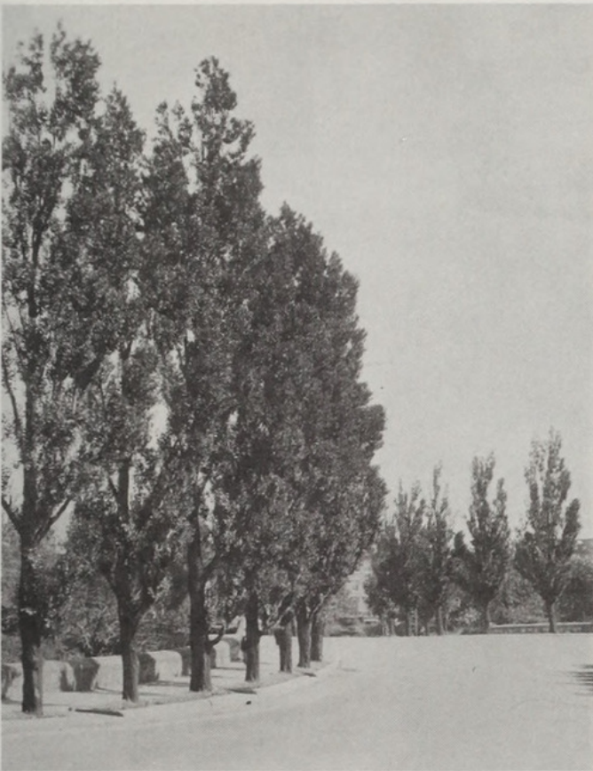
Lombardy poplars on Boston's Fenway, 1919.