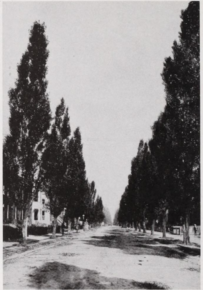
The 1915 caption read: "This tree has a special landscape value which no other tree possesses and under special conditions it can be used to better advantage than other trees" (Levison, American Forestry , Vol. 21).

By mid-nineteenth century it had fallen from favor elsewhere, too. Downing, that period's chief arbiter of landscape taste and American disseminator of English practices, complained in 1841 that it had been so over-used as to become "tiresome and disgusting." 15 Another writer commented in 1870 that