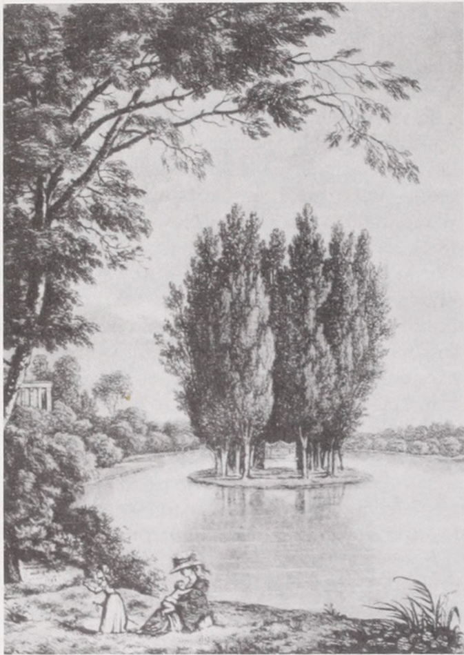
The Lombardies that encircled the tomb of Jean-Jacques Rousseau at Ermenonville, France, formed one of Europe's most famous tree plantings. The tableau was often imitated ( Promenade ou itinéraire des jardins d'Ermenonville [S. Girardin], 1788).

pavement above ground and penetrate and clog water and sewer pipes below ground. Boston's Park Street Lombardies were replaced by American elms as early as 1826. By 1871, an ordinance compelled the removal of existing specimens and banned the planting of new ones in Albany, New York. By then, many cities, including Washington, D.C., and Brooklyn, no longer tolerated the Lombardy. 14