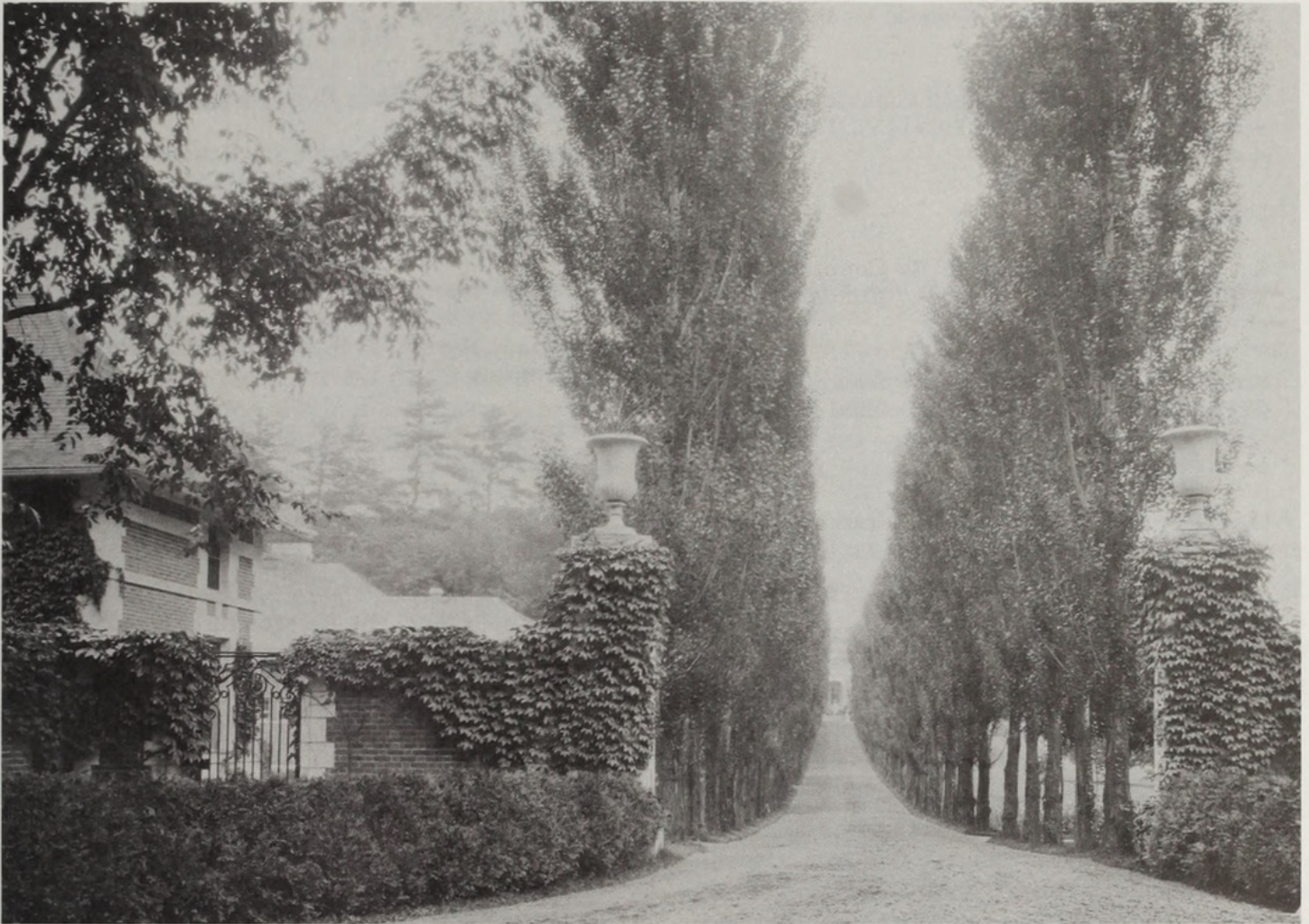
An allée of Lombardy poplars directs visitors through the entrance of an estate in Lenox, Massachusetts, 1920.

canker, also known as Dothichiza canker, is one of the major diseases of poplars in general, but it affects the Lombardy most severely. Identified in the United States in 1915, the canker occurs wherever Lombardies grow, but regional conditions and the preexisting health of the individual plant appear to affect the extent of infection. No cure is known. 23