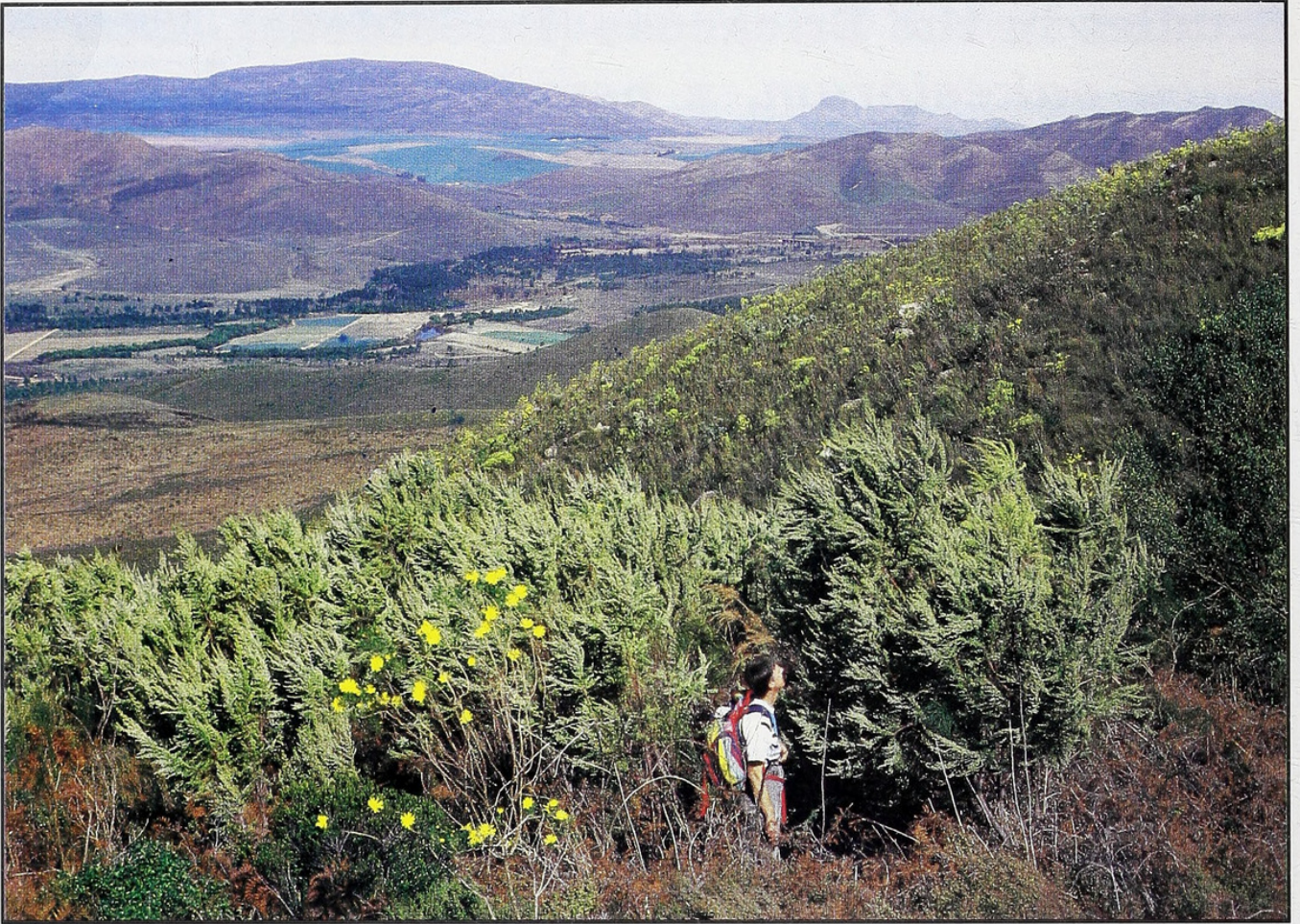
Fig. 1. Population of Erica oakesiorum above Greyton with Inge Oliver to show scale.

The plants were mostly 2–4m tall with the largest in the centre of the kloof being 4m tall. As such the species must be counted among the tallest of southern African heathers as only three other species are reported to reach this height in the wild, E. caffra L., E. canaliculata Andr. and E. dracomontana E. G. H. Oliv. The size of the plants of the new species is all the more surprising because the whole area was devastated by a fire only nine years ago. This was confirmed by the branching pattern indicating a remarkable yearly growth of 30–40cm.