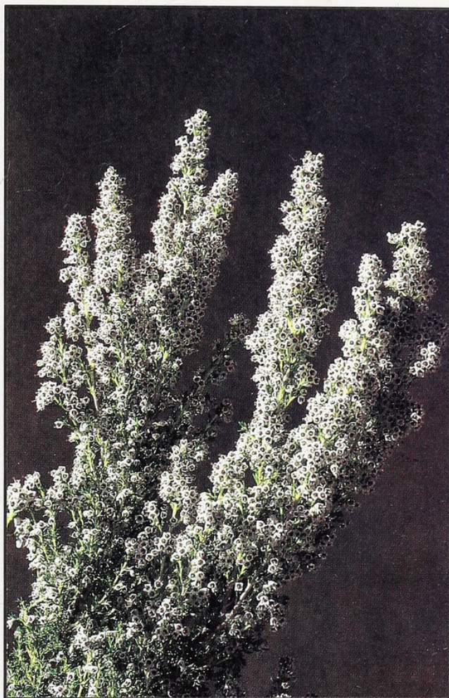
Fig. 4. (right)

Erica oakesiorum . A, flowering branch, natural size; B, branch; C, leaf; D, flower; E, sepal; F, stamen, back, front and side views; G, ovary, whole on left & opened laterally on right; H, capsule with one valve removed; I, subalveolate seed; J, testa cells; all drawn from the type collection. © Inga Oliver.