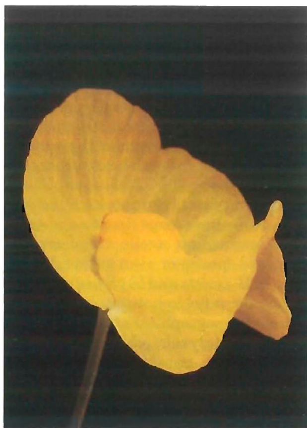
Figure 2: U. gibba —Chasmogamous flowers of a Florida clone

can find any ripe seed capsules opening. Do they open by a vertical split that divides the capsule into two equal halves? If so, chances are you're looking at U. gibba . But for a good key, certainly more complete than the information in this paragraph, look to CPN 20:1-2.