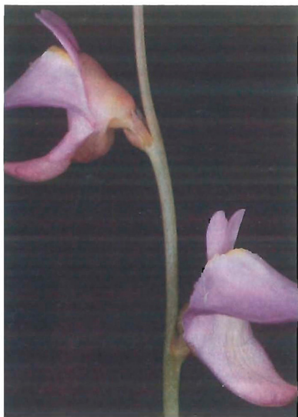
Figure 2 U. lateriflora : A near floral pair. Even the bracteoles can be longer than the pedicels of Australes species.