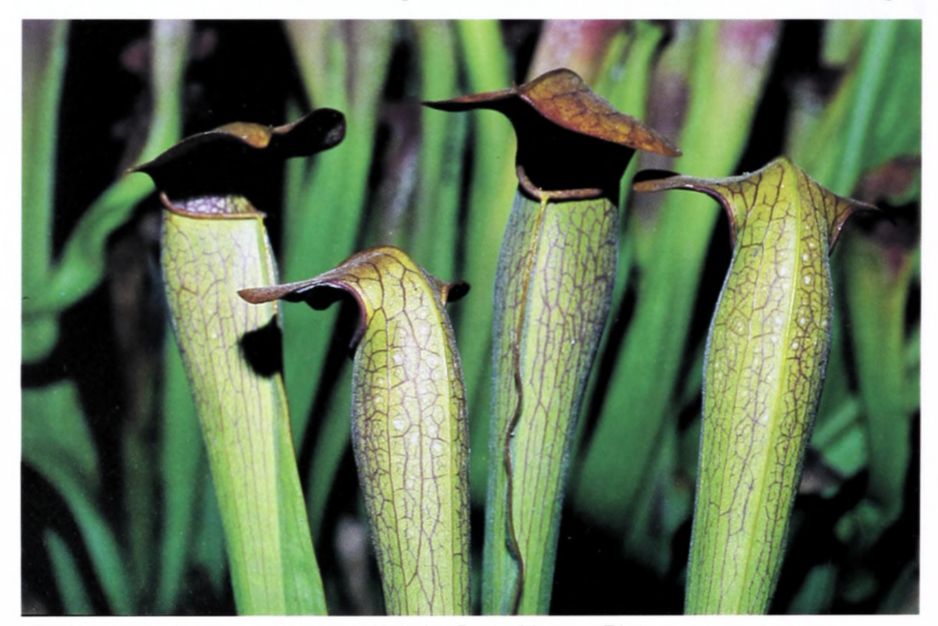
Figure 1: Sarracenia 'Imhotep'

I nominated the name 'Imhotep' on 2 October 1999, and submitted it for regis-