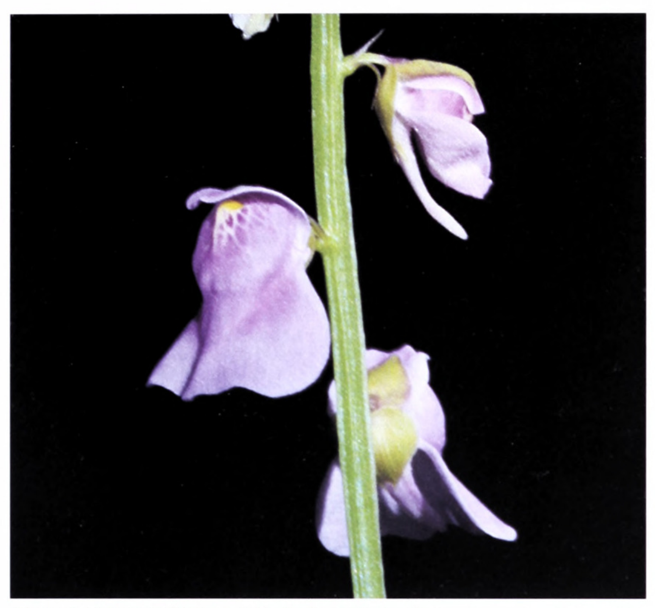
Figure 6: Utricularia 'Cthulhu'

I have discussed U. calycifida before, in pages 9-13 of the 21:1-2 issue of Carnivorous Plant Newsletter (1992). In that article I used the tentative, descriptive phrase "purple veins" to describe one commonly cultivated form. This form has petiolate leaves with a oval lamina that are veined throughout with deep purple pigmentation (see Carniv. Pl. Newslett. 21:1-2, p. 10, Figure 1:1). The flowers are large, and the apron-like lower corolla lobe hangs down and nearly completely hides the spur. The corolla is pink, but with a yellow patch (edged in white) on the proximal palate bulge (see Carniv. Pl. Newslett. 21:1-2, p. 12, Figure 3). This plant is being established as the cultivar Utricularia calycifida 'Yog-Sothoth'.