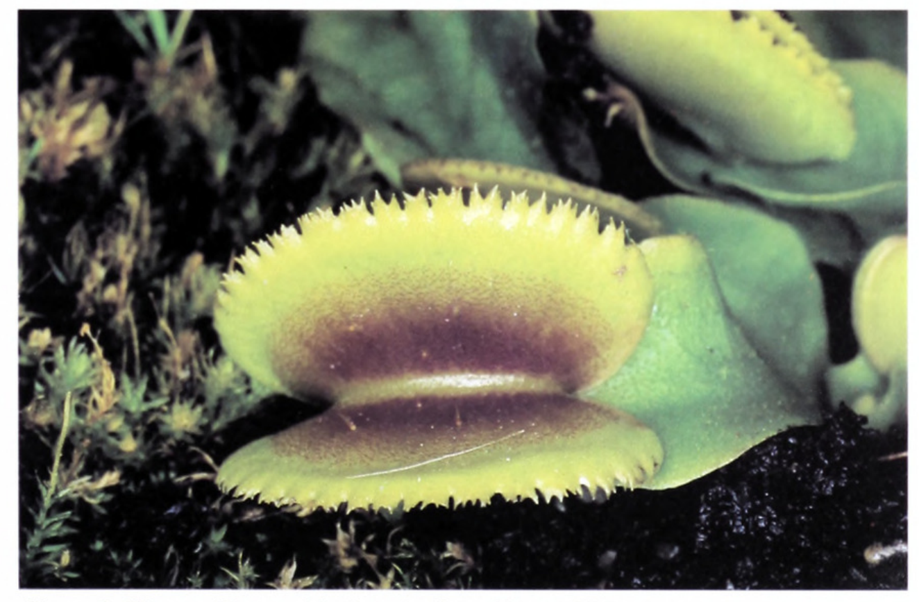
Figure 3: Dionaea 'Sawtooth' Volume 29 March 2000