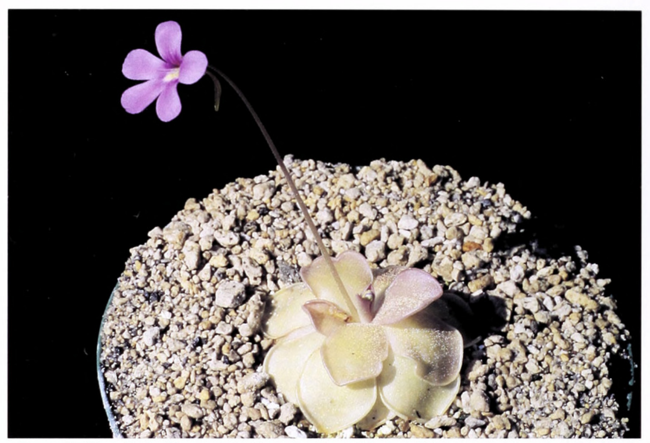
Figure 4: Pinguicula 'Pirouette', photo by Barry Meyers-Rice