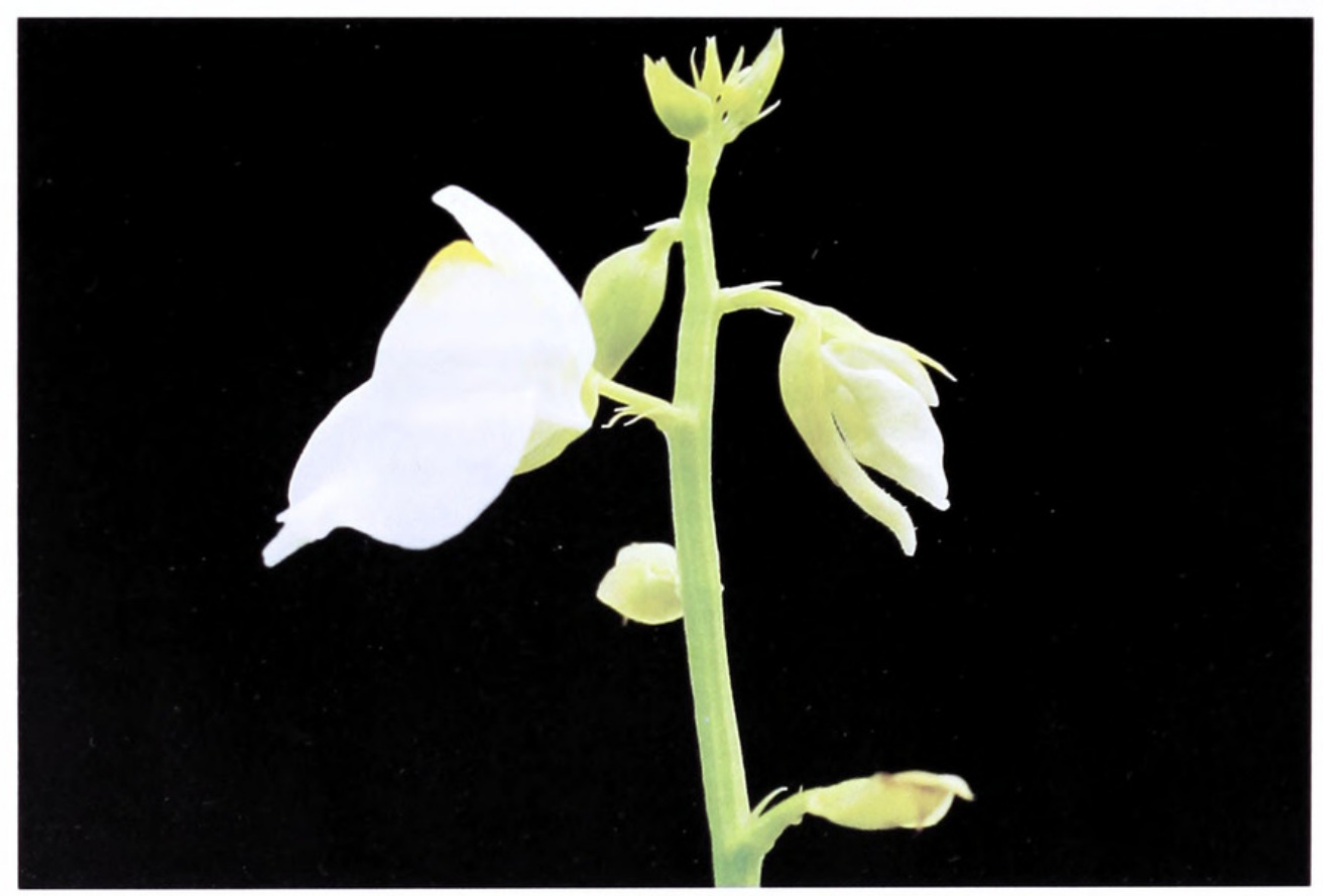
Figure 5: Utricularia 'Lavinia Whateley'