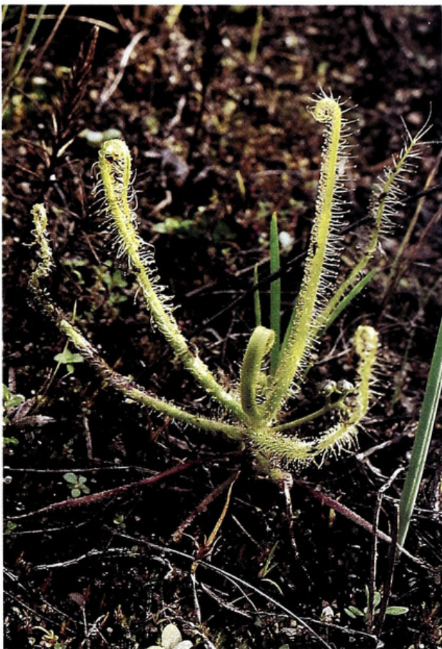
Figure 3: Drosera indica from Narrabri with functionally female flowers.