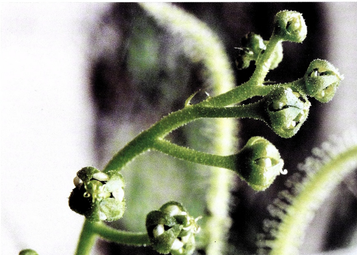
Figure 4: Functionally female flowers on Drosera indica .