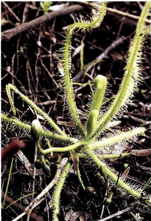
Figure 2: Typical Drosera indica from Narrabri.