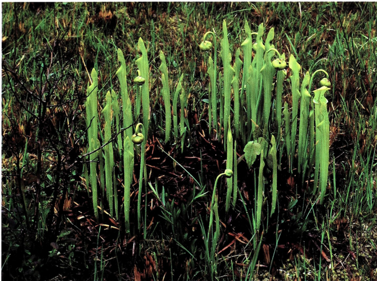
Figure 1: Sarracenia oreophila in North Carolina, just after a burn.