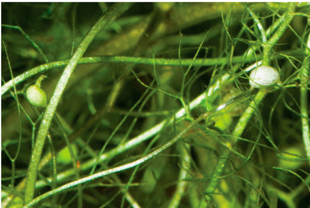
Figure 1: Utricularia inflata tubers on long, strand-like shoots. The tuber at far left has extruded a new growth.

The familiar Utricularia inflata also produces carbohydrate-rich tubers, although they are only a few mm in diameter (see Figure 1). Utricularia inflata is in the genus section Utricularia , which includes the most common aquatic or semi-aquatic species such as U. australis , U. gibba , U. macrorhiza , and U. vulgaris . (The related U. platensis also generates tubers.) Tubers can usually be found on large U. inflata plants, and their presence is a useful way to distinguish it from similar species (such as U. macrorhiza ). Supposedly, being stranded on mud is particularly conducive to encouraging U. inflata plants to produce tubers (Taylor 1989). But why the plant produces its tubers on whip-like shoots, several cm long, defies easy explanation!