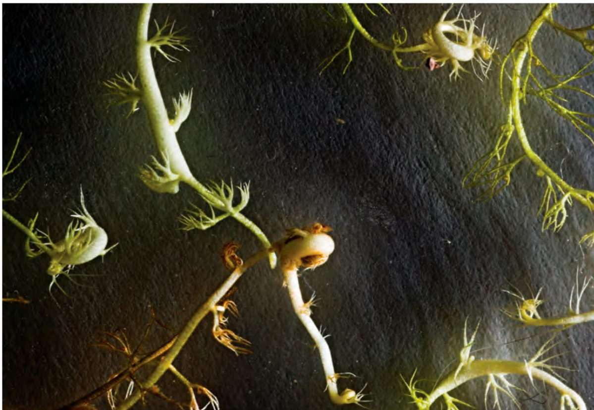
Figure 3: Utricularia radiata shoots with swollen sub-tubercular organs, twisted into short loops. The loops at top right and middle-left are starting to uncurl.

Rivadavia, F. 2007. A Genlisea myth is confirmed. Carniv. Pl. Newslett. 36: 122-125.