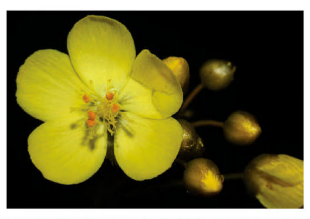
Figure 3: Drosera moorei flowers have a nectar sweet scent and wonderful bright yellow color.