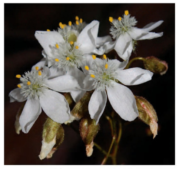
Figure 1: Drosera macrantha subsp. macrantha "silky sepal form" showing the distinctive hairs on the inflorescence. This sundew, from the Wongan Hills, has sugary sweet scented flowers and thus differs from all other forms of this subspecies sampled for this project.

The majority of the rosetted tuberous sundews sampled had nectar sweet floral fragrance of moderate strength. The exceptions were the fruity sweet scents of flowers of both subspecies of D. macrophylla Lindl.