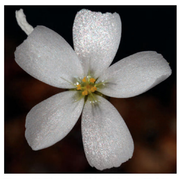
Figure 2: Drosera radicans is one of the few tuberous sundew found to have unscented flowers in this study.