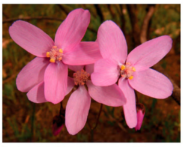
Figure 4: Drosera marchantii subsp. marchantii plants flower in abundance after fire and have large and abundant flowers with a strong fruity sweet scent.