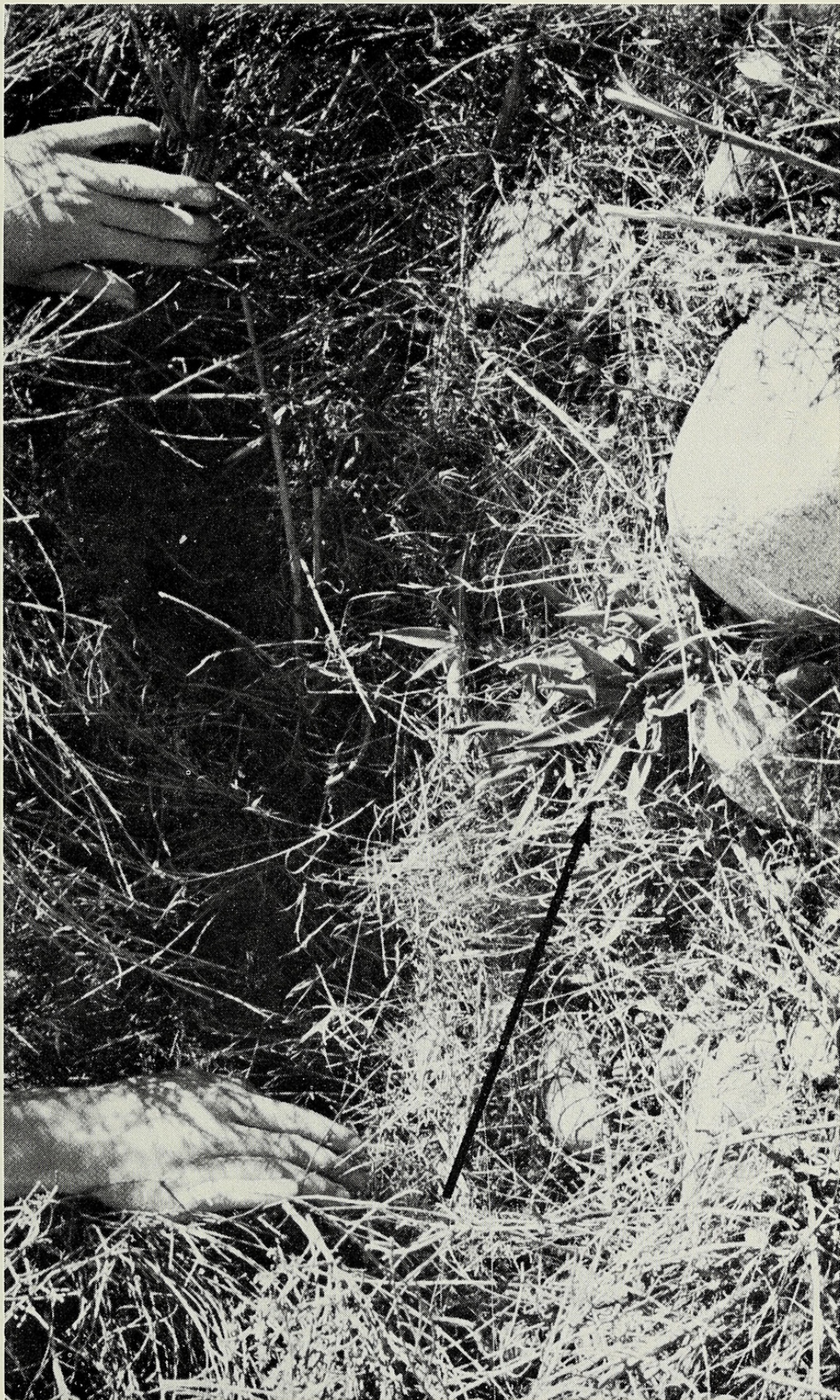
Fig. 2. Dudleya lanceolata , shown by arrow, as exposed by pushing the brush away.

J. Res. Lepid. 1(4): 237- 244, 1963). In the distance may be seen a portion of the rock pile that is nearly all that is left of the formerly much wider range of the species at this location.