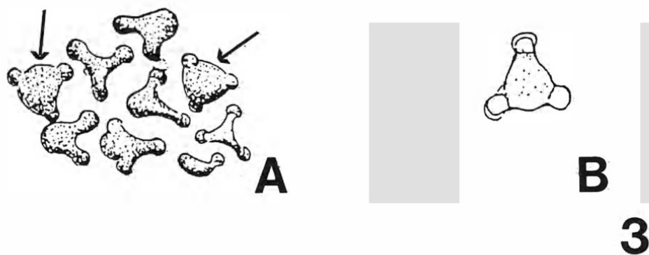
Figure 3. Illustrations of Persoonia -type pollen grains as drawn by T. Rayment. A = pollen grains from Rayment (1950) showing regular, hydrated grains (arrows) outnumbered by irregular and/or nonhydrated grains from flowers of P. lanceolata ; B = pollen grain from Rayment (1959) showing an operculum over each pore. Rayment never included a scale in either publication and drawings here are reproduced twice the size of the originals.

hovered six to eight cm down wind of flowering branches. Males were not observed to forage actively for pollen, but they did contact dehiscent anthers when perching on the flowers or while inserting their elongated mouthparts between the tepals at the apex of the floral tube. Pollen washes showed that only one male captured carried more than 90 grains of Persoonia pollen. In contrast, one female of L. davisii , one female of L. hamatus and fifteen females of L. filamentosa carried >100 grains of Persoonia each distributed in their scopae. Persoonia grains are often visible clinging to the elongated mouthparts of pinned specimens (Fig. 2).