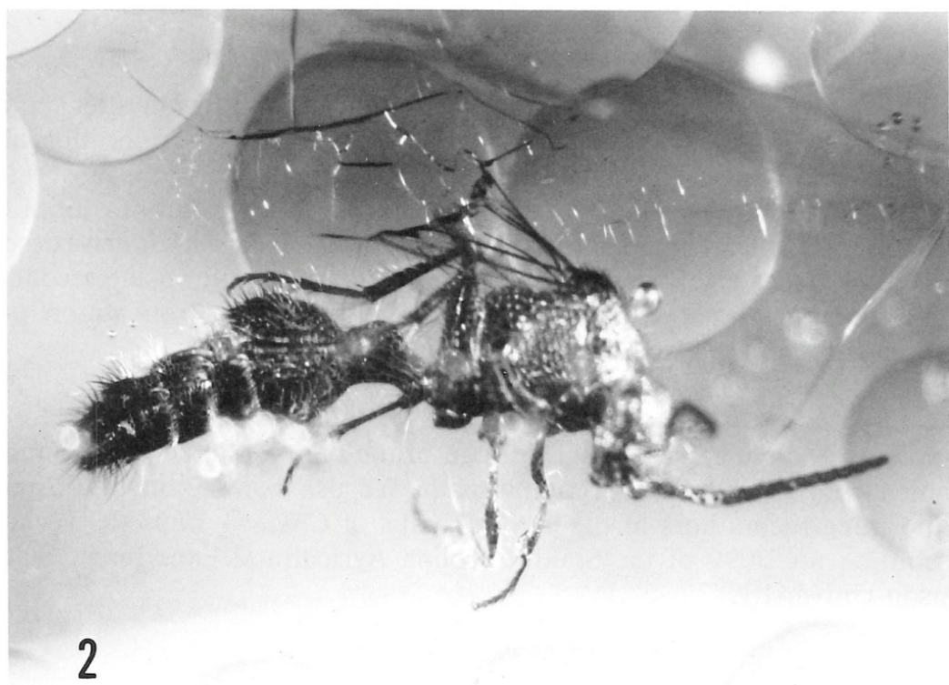
Figures 1–3. Holotype of Dasymutilla dominica Manley & Poinar. Figure 1. Dorsal view. Figure 2. Lateral view. Figure 3. Ventral view of abdomen showing median pit filled with hairs on second sternite (arrow).