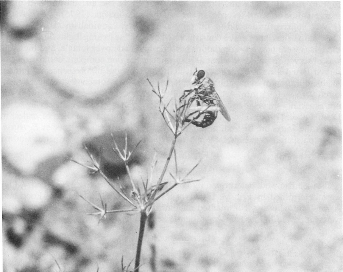
Figure 3. Ovipositing female of Efferia wilcoxi .

than females (for males, \bar{x} = 2.49 mm, n = 14; for females, \bar{x} = 2.36 mm, n = 44), although sample sizes are not especially large. Table 1 gives sizes of prey and shows that mean sizes differ among taxa as has been shown for other asilids (e.g., Hespenheide and Rubke, 1977; Weeks and Hespenheide, 1985).