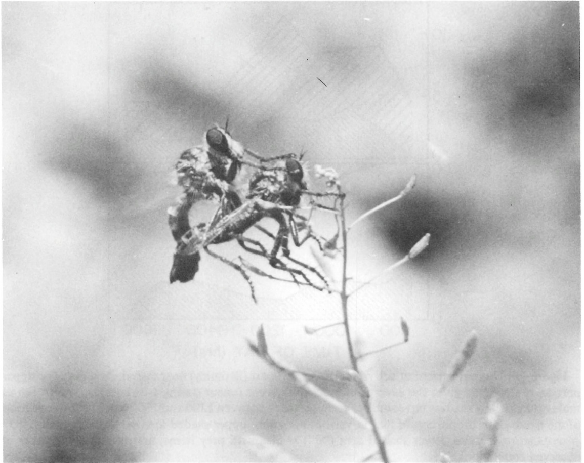
Figure 2. Copulating pair of Efferia wilcoxi .

sp.—1. Hymenoptera were comprised of chalcidoids except for two small bees. Diptera included the following taxa: Agromyzidae—3; Cecidomyiidae—2; Bombyliidae, Glabellula sp.—1, Mythicomylia sp.—1; Chloropidae—4. Heteroptera included primarily Lygaeidae, except for two small Miridae and one Reduviidae.