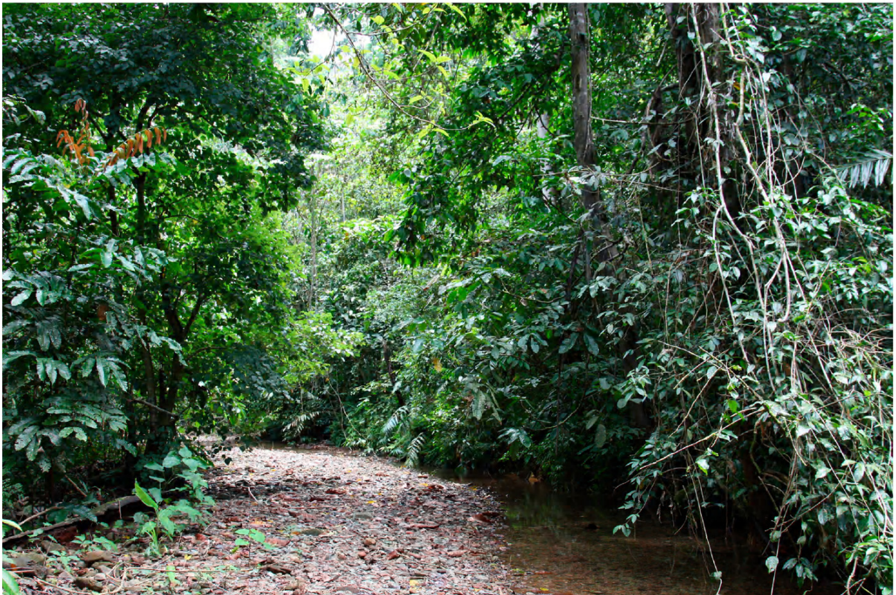
Figures 1-2. Riverine forest in River Hakau valley, S Misool Island, E Indonesia - observation spot for Cyrtodactylus papuensis (Brongersma, 1934).