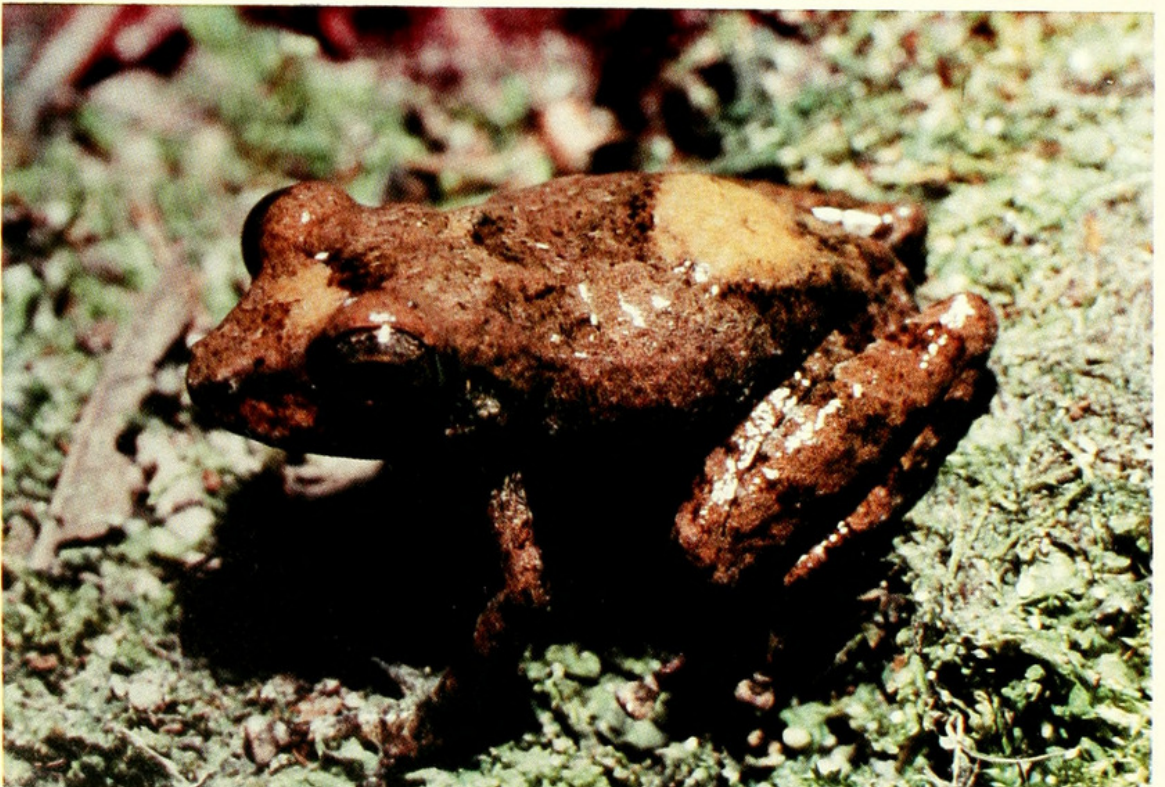
Fig. 2. Eleutherodactylus bearsei : Top—KU 212268, holotype, female, 38.0 mm SVL. Bottom—KU 212269, paratype, male, 22.7 mm SVL.