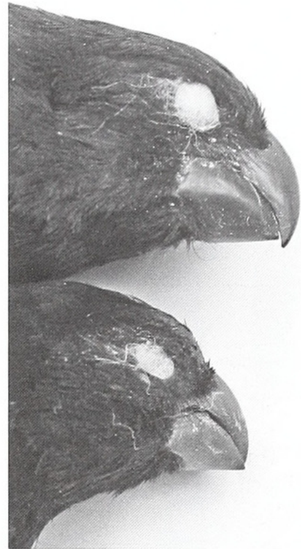
Figure 2. Comparison of bill size between Cuban Bullfinch Melopyrrha n. nigra of Cuba (lower bird) and M. n. taylori of Grand Cayman (upper bird), United States National Museum, Smithsonian Institution, Washington DC (James W. Wiley)

Female nigra is uniform dull slate-black and less glossy, sometimes almost dark slate, especially on the posterior underparts. The upperparts are almost uniform except the lower neck, back and rump are tinged brownish contrasting with the slate-black head. Female taylori is bicoloured, being mostly blackish slate on the head and upperparts, although not as dark as nigra , and has dull brownish olive-grey lower abdomen and flanks (Fig. 3). Throat, breast and upper abdomen are not dull black as in nigra , but are blackish grey contrasting with a paler lower abdomen and flanks. In Cuban females, the slate-black coloration is practically uniform from throat to undertail-coverts. Immature nigra resembles adult females, but have brownish wing feathers and tail, a smaller and less contrasting white wing patch, with no gloss or slate tones. Immature male taylori resemble adult females, with an olive-tinged dark head and much paler olive-grey posterior upperparts (Ridgway 1901), brownish fringes to the primaries, and abdomen tinged cinnamon. White in the wing is reduced or absent in both sexes (Bradley & Rey-Millet 2013).