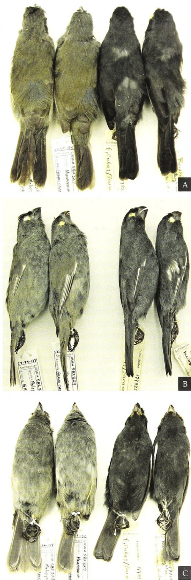
Figure 3. Comparison of plumage coloration between female Cuban Bullfinch Melopyrrha nigra taylori of Grand Cayman (left two individuals) and Melopyrrha n. nigra of Cuba (right two individuals): (A) upperparts, (B) lateral view, (C) underparts, United States National Museum, Smithsonian Institution, Washington DC (James W. Wiley)

Although formerly considered common on Grand Cayman, the bullfinch's range has been reduced and it is now rare to absent west of Savannah due to urban development and loss of habitat due to forest clearance and hurricanes. East of Savannah, it is a locally common resident breeding mainly in dry forest within the protected Botanic Park and Mastic reserve, and in shrubland and woodland in the north and east where continued development threatens habitats (Bradley 2000, Bradley & Rey-Millet 2013). It bred infrequently in mangroves but since Hurricane Ivan (2004) breeding has not been observed in mature black ( Avicennia germinans ), white