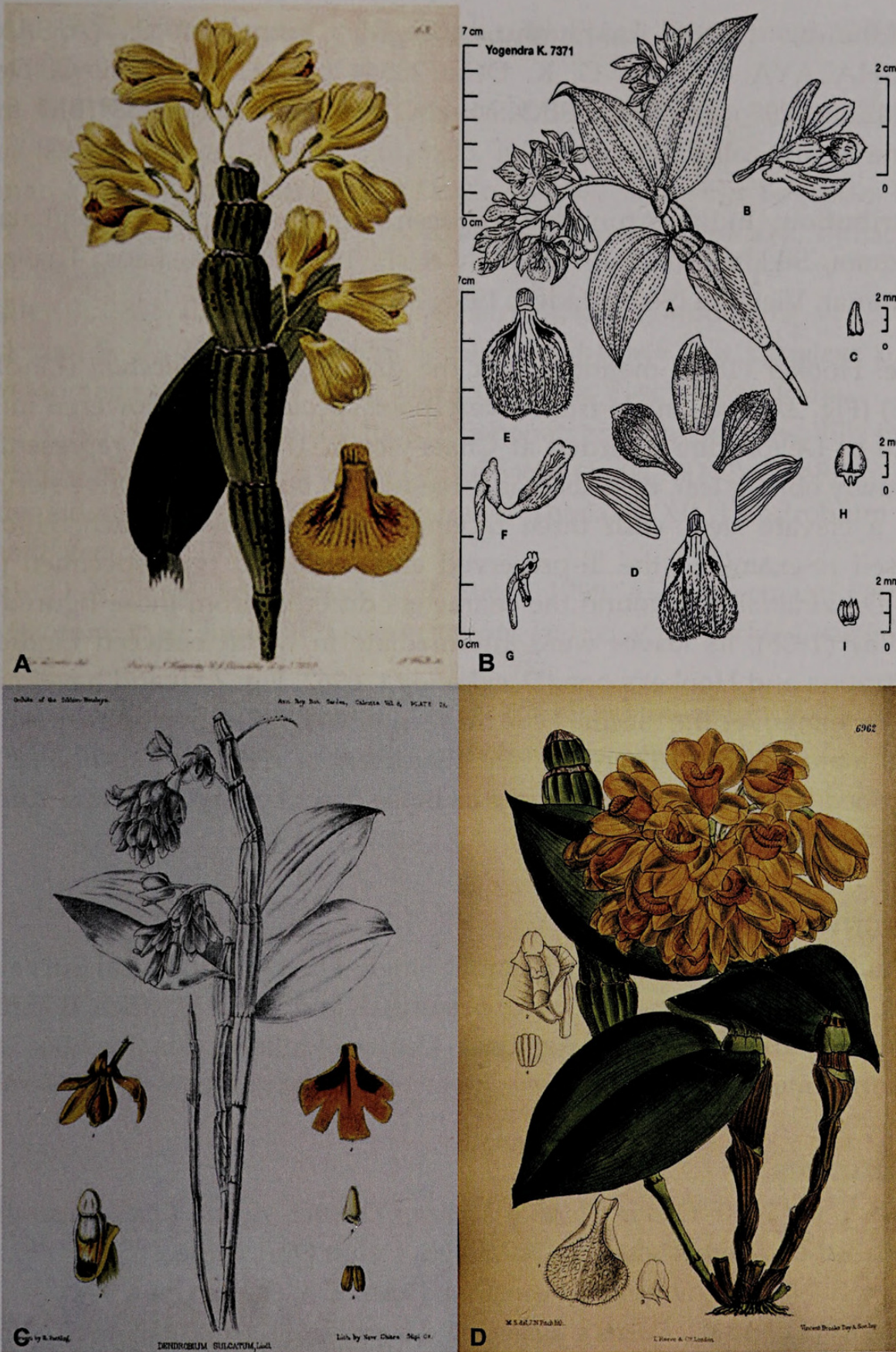
Fig. 2: Dendrobium sulcatum & Dendrobium meghalayense