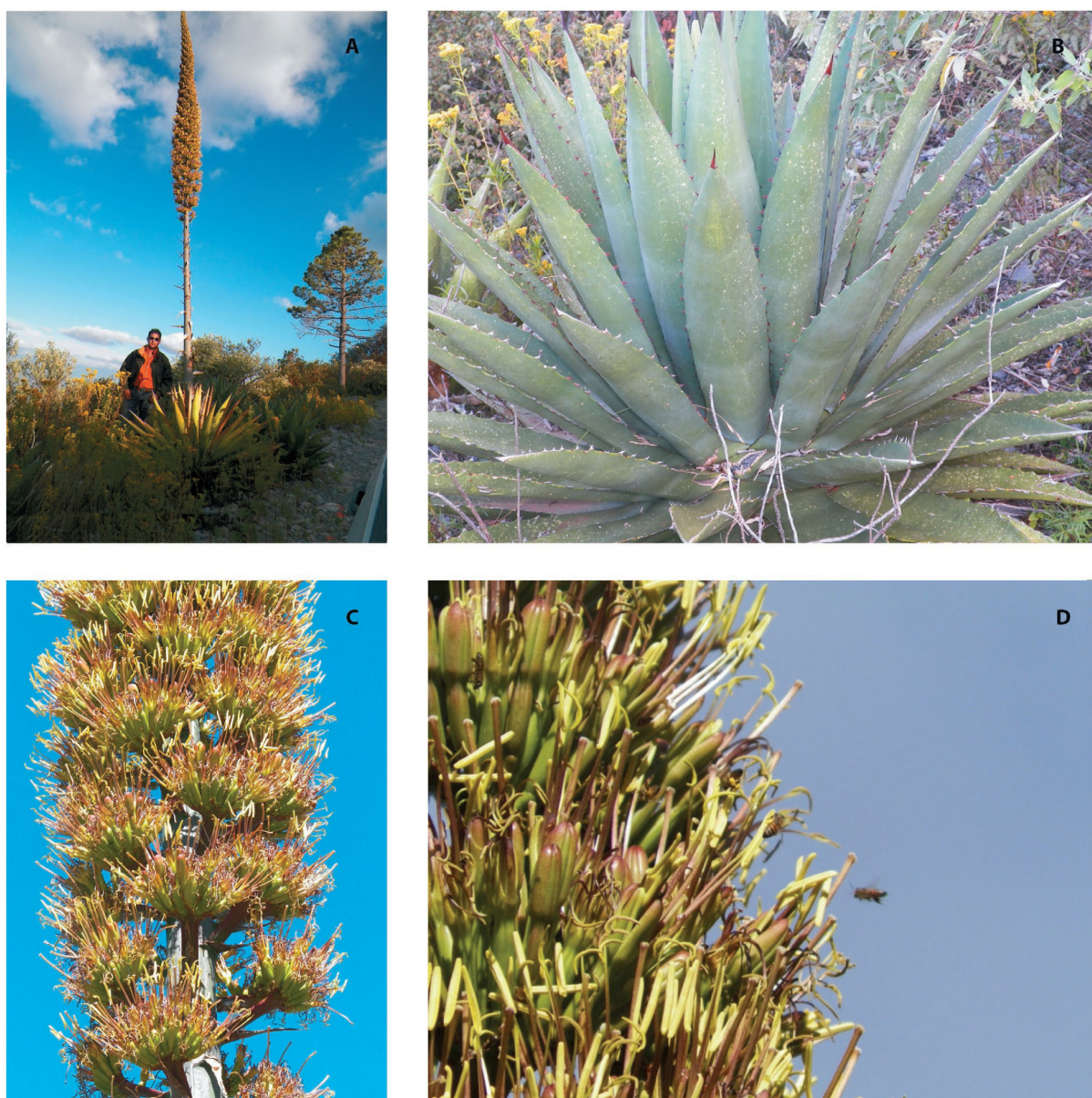
FIG. 2. Agave × madrensis . A. Flowering plant. B. Rosette of leaves. C. Inflorescence close-up. D. Close-up of flowers and pollinators.

claviform, trilobate. Capsules oblong to slightly ovate, 4–6 cm long and 20–25 mm wide, rostrate, dark brown; seeds lunulate, flattened, 5–6 mm long, 4–5 mm wide, black.