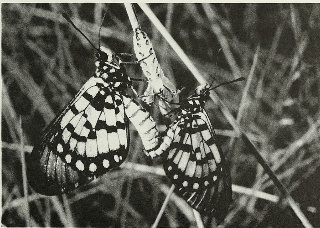
Fig. 4. A pair of Acraea andromacha on a dried grass stem; the pupal case of the freshly eclosed female appears between the two butterflies.