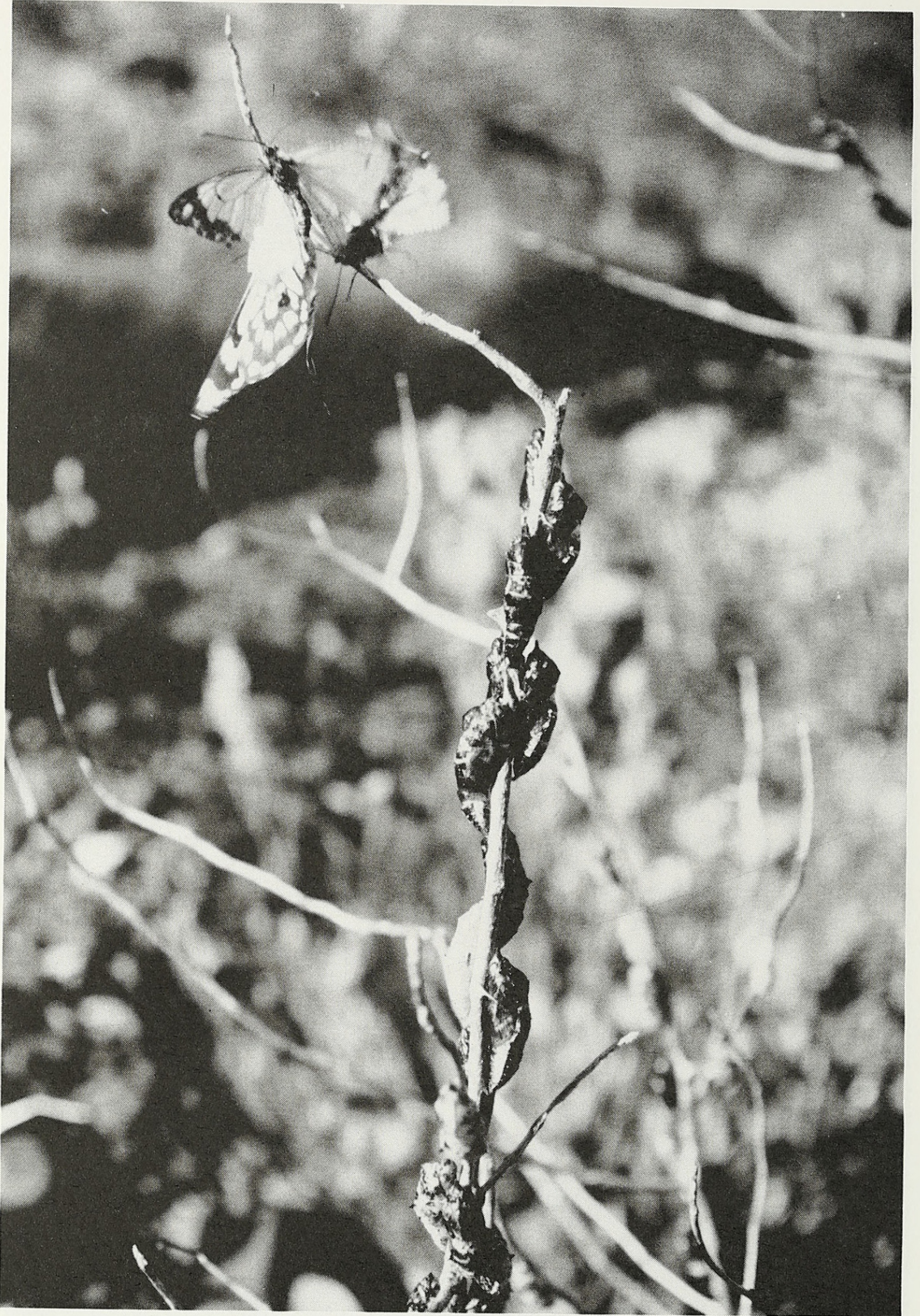
Fig. 2. Unmated males of Anaphaeis java courting a copulating female at Karajina National Park, Western Australia. Note the line of pupal cases below the adult butterflies.