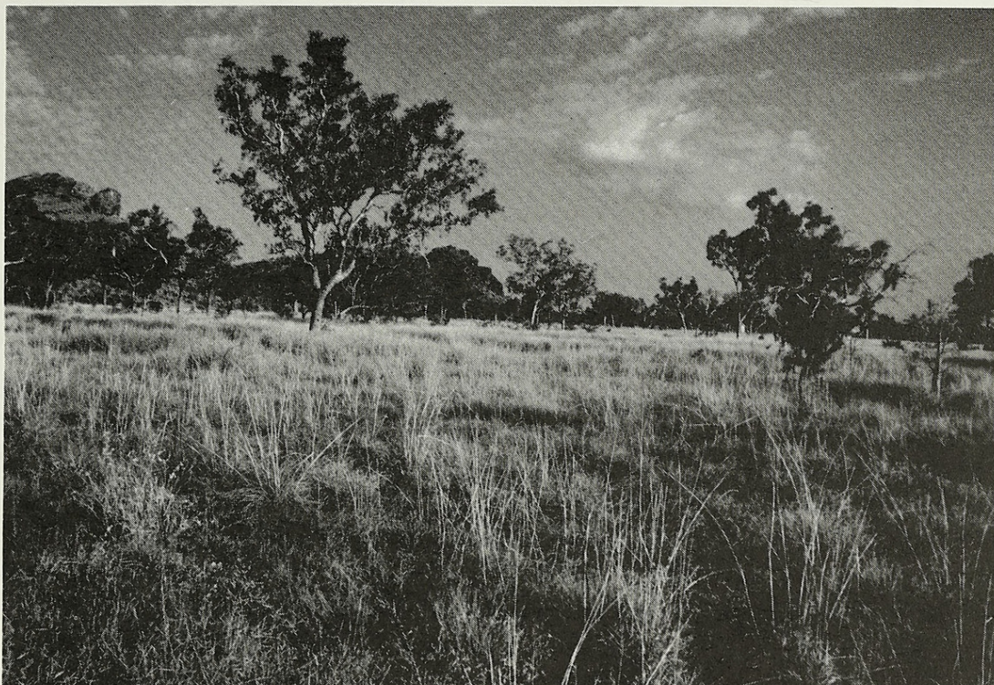
Fig. 3. The short grass plain that lies within taller grasses in the open savannah-eucalyptus woodland at Windjana National Park, Western Australia.