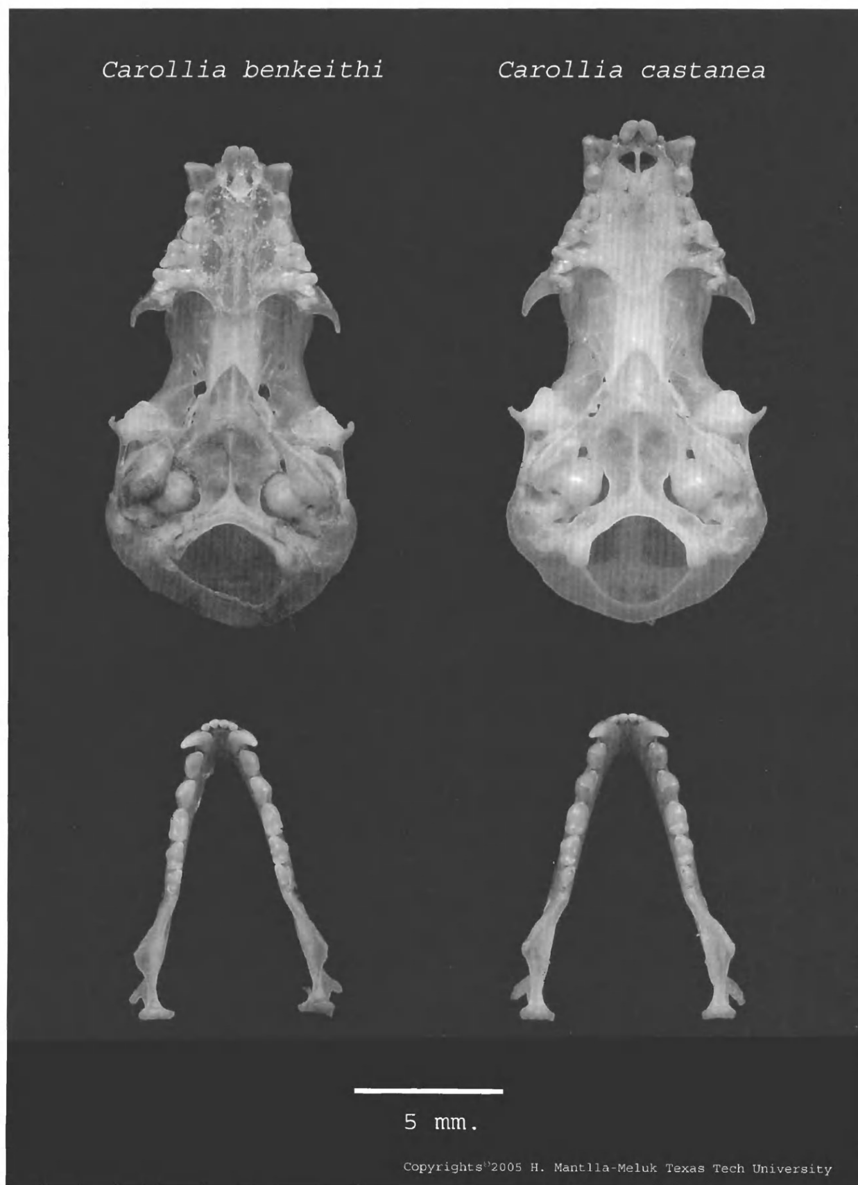
Figure 2. Ventral view of the skull and mandible of the holotype of Carollia benkeithi (TTU 46187) and a specimen of C. castanea (TTU 13177) from Honduras.