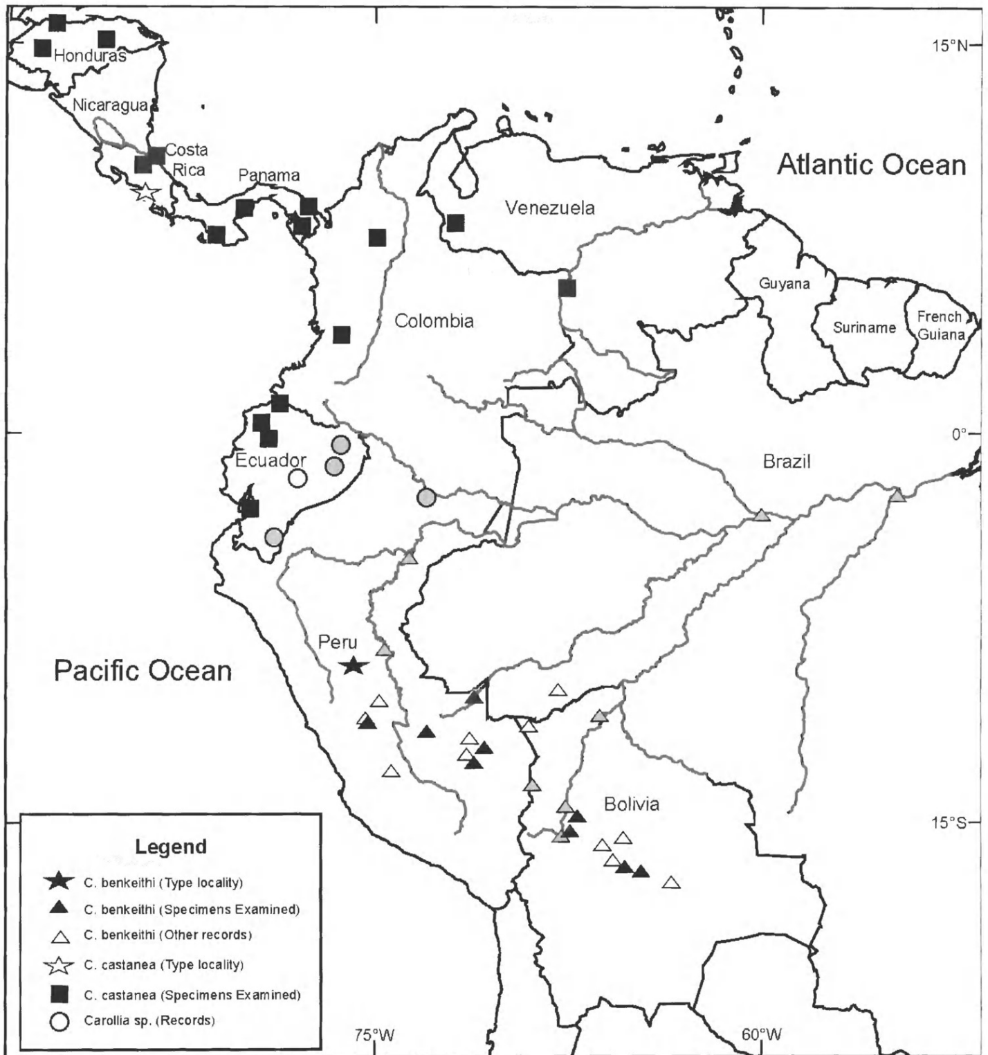
Figure 1. Distribution of the three species of the Carollia castanea species complex. Localities for C. benkeithi , new species, as determined by specimens examined and literature references. The stars represent type localities for C. benkeithi and C. castanea . Some localities are lumped for purposes of graphic representation.