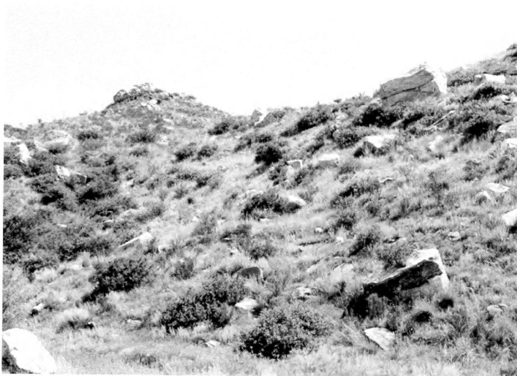
Figure 3. Typical rocky upland habitat at Lake Meredith National Recreation Area. Note common shrub and grass species amongst the boulders.

areas. The individual we took (collected on 10 July) was a male with testes that measured 10 x 5.