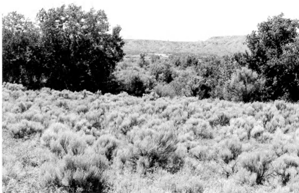
Figure 2. Typical riparian habitat along the Canadian River at Lake Meredith National Recreation Area. Dense vegetation at foreground is sand sage; mature cottonwood trees flank salt cedar and false willow in background.

1991). No specimens were taken during our survey and there are no records from Lake Meredith NRA. However, this species is known from Hutchinson County.